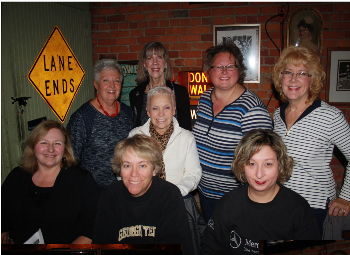
Some of our "Ladies of Mercedes":