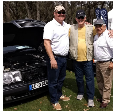
AMELIA ISLAND CARS AND COFFEE