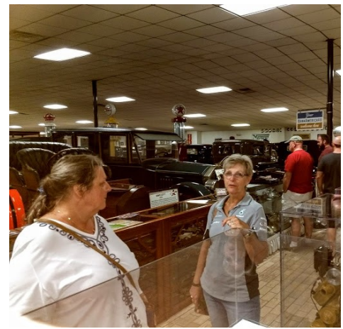
← GARLITS MUSEUM →