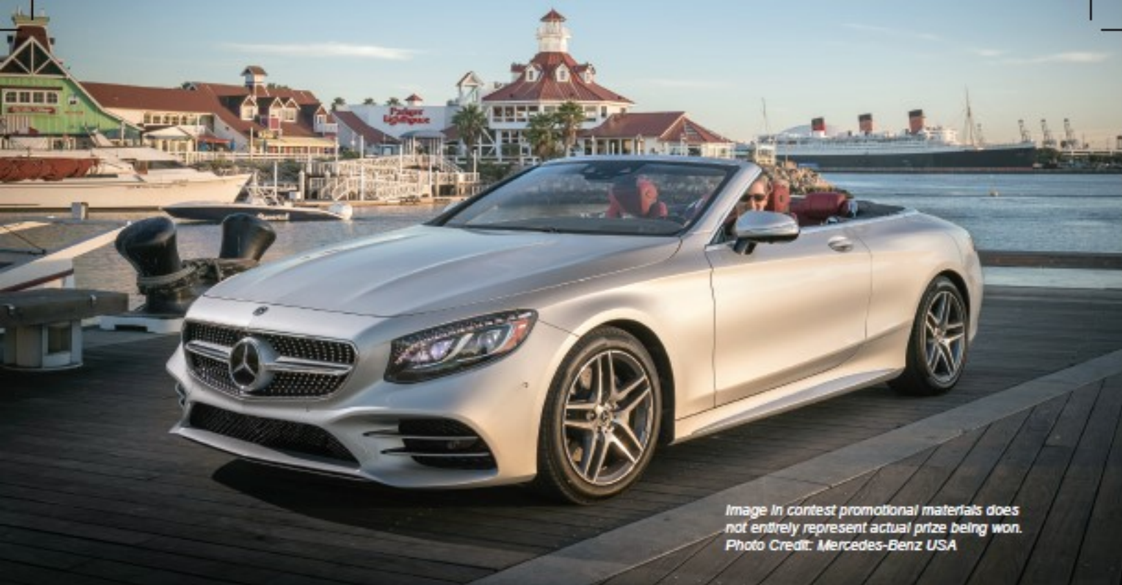
Image in contest promotional materials does not entirely represent actual prize being won.