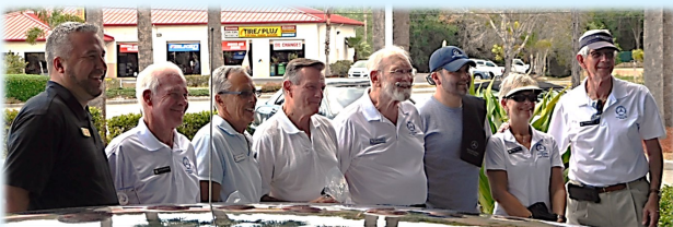
And the trophy line-up!