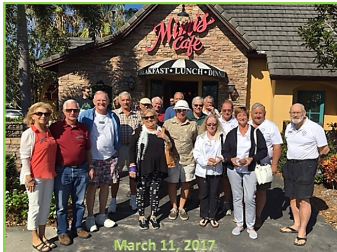
March 11, 2017