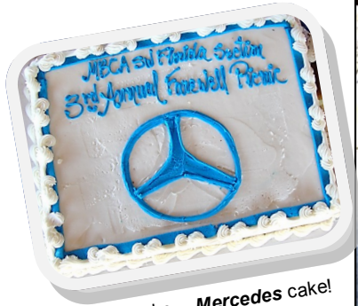
Mmm...cake... Mercedes cake!

Sunday, April 10, 2016, 12:30 PM, Lakes Park