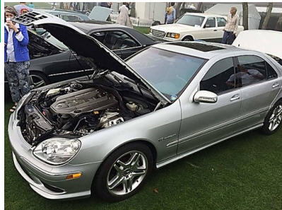
Members' cars... Harruff's 2003 S55 AMG,