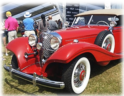
1939 MB 540K valued at $3-4M. At the Concours on Sunday morning.