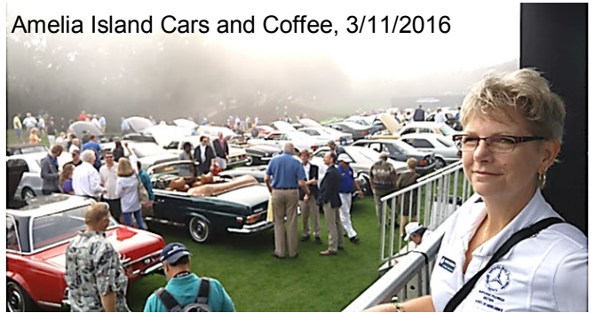
Amelia Island Cars and Coffee, 3/11/2016