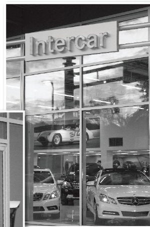
Pickup and delivery - Loaner car.