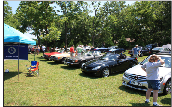
Members' cars on display at EuroBrit car show in Madison's Dublin Park

Next year we will have our cars also judged by MBCA rules.