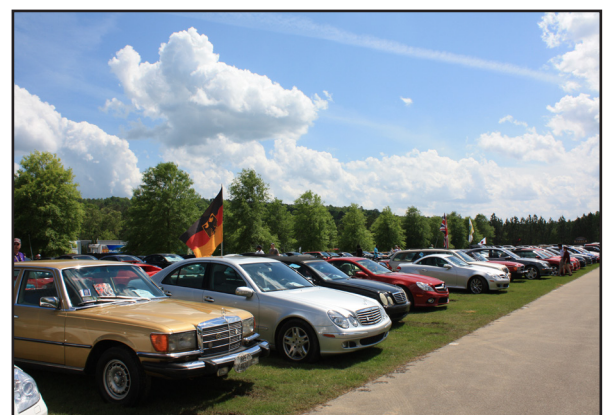
Top: L to R GLE 63 AMG coupe, new C 63 S AMG, CLA 45 AMG