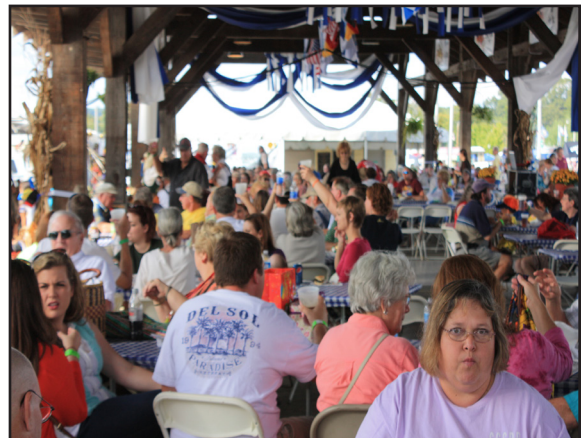
Celebrating Oktoberfest at Cullman's Festhalle