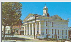
Newton, N.J., High Street on the Green

M ay is one of the loveliest times of year in New Jersey, and NJ 519 is one of the loveliest and varied drives in the state.