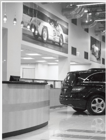
Convenient customer service DRIVE-THRU.

An exceptional dealer, with exceptional new & pre-owned prices.