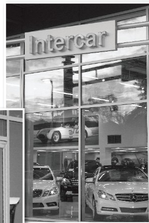
Pickup and delivery - Loaner car.