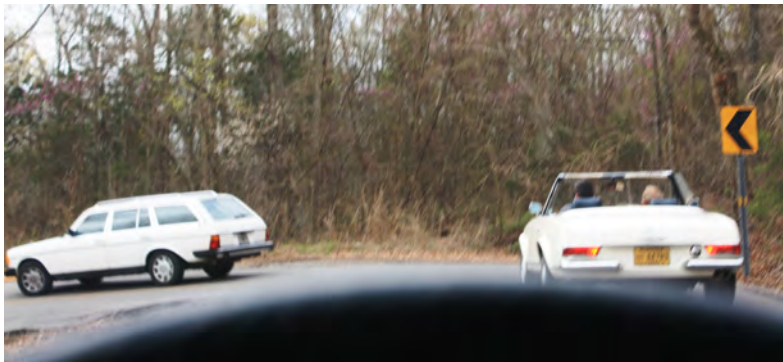
Crow Mountain, Alabama