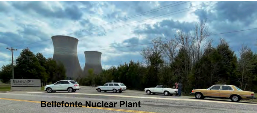
Bellefonte Nuclear Plant