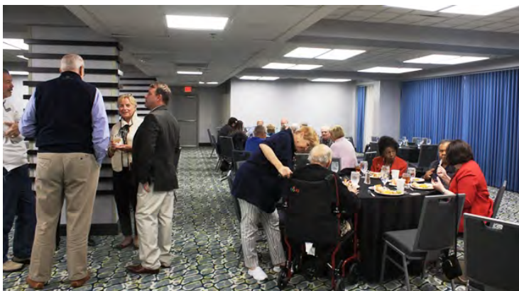
Dinner at The Doubletree

On Saturday morning MBCA will be featured in the Cars & Coffee. We have traditionally been in front of the Mercedes-Benz pavilion near the entrance. We don't think MBUSA will be there this year, so we are not sure where our area will be.