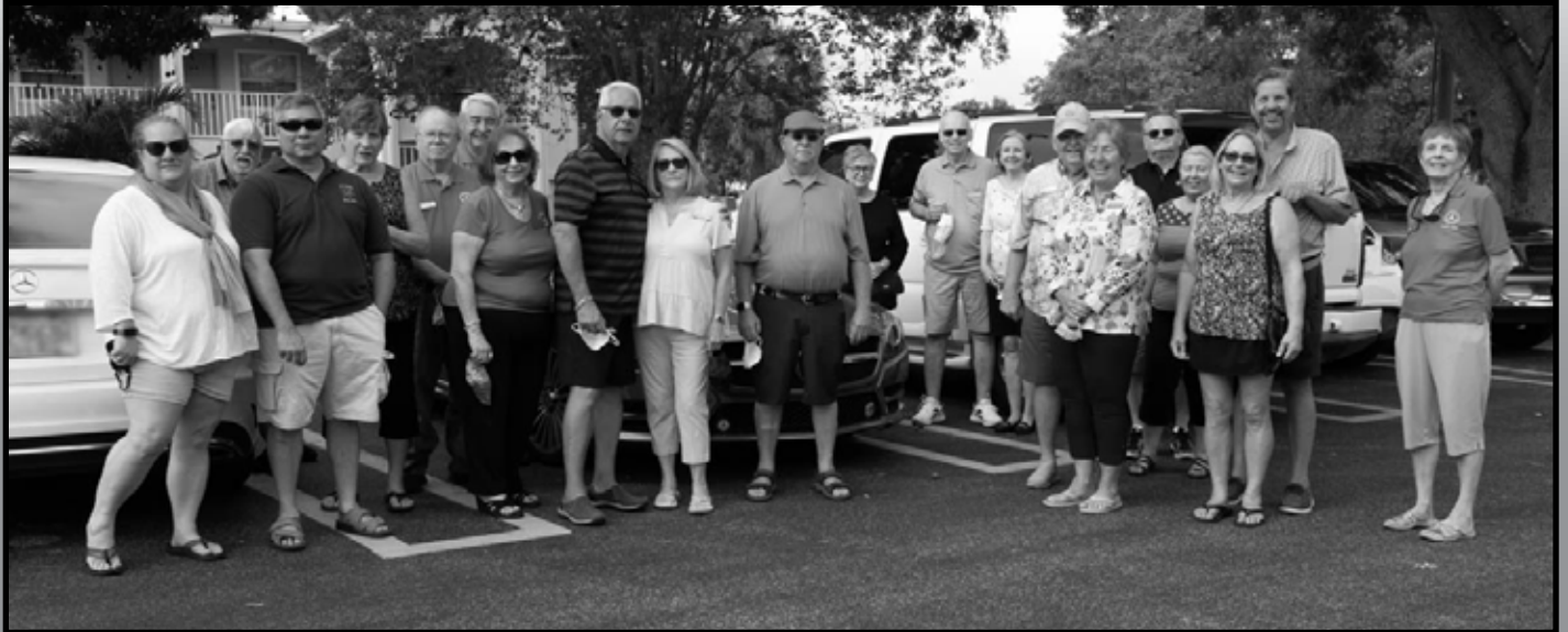
All of us before the Rally See Page 6