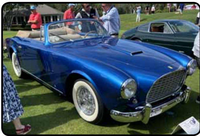
Below: 1952 Ferrari