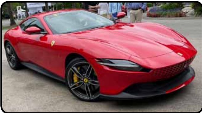
Above: 2021 Ferrari Roma