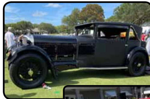
Left: 1929 Bentley

Despite this year's anomalies, the 2021 Amelia Island Concours has to be rated an unqualified success. After 14 months in which most car related activities were cancelled, and the rest confined to computer screens, it heralded a welcome return to the real world.