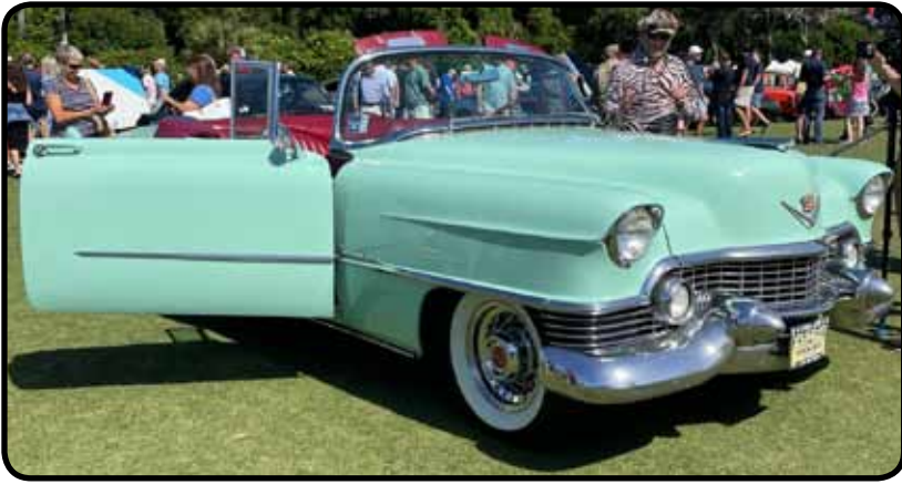
Above: 1956 Cadillac