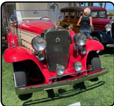
Above: 1932 Cadillac 355-B