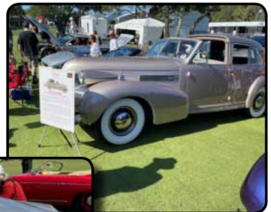
Right: 1940 Cadillac 60 Special