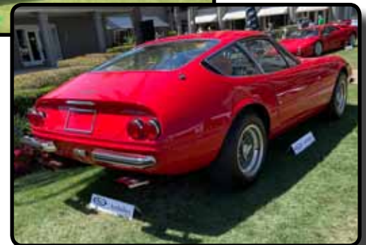
Below: 1975 Ferrari 275