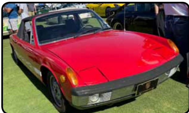
Below: 1971 Porsche 914