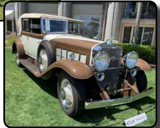
Amelia Island

rants; this year guards were posted at every entrance to the Ritz to prevent all except guests registered at the hotel from entering. The throngs who wanted to browse through the offerings of the vendors associated with the Concours or attend the seminars which were part of the annual ritual, were directed to a single side entrance and barred from using all but one set of rest rooms.