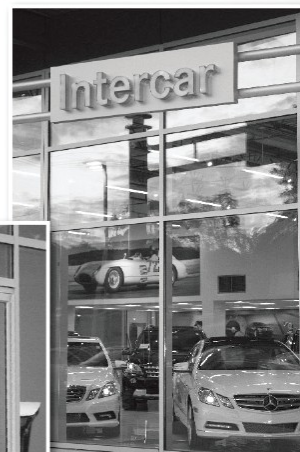
Pickup and delivery - Loaner car.