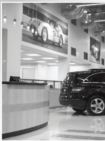
Convenient customer service DRIVE-THRU.

An exceptional dealer, with exceptional new & pre-owned prices.