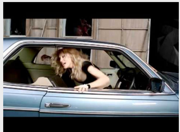
Madonna exiting a W123 coupe, "4 Minutes" (2008)

[ https://www.youtube.com/watch?v=aAQZPBwz2CI starting at 1:27]