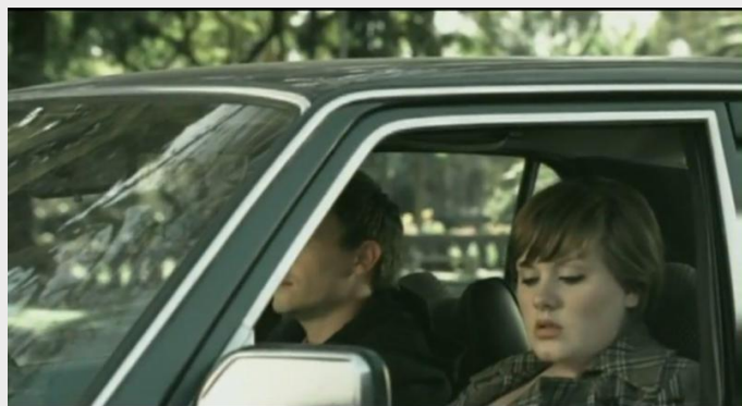
Adele waiting in a W123 sedan, "Chasing Pavements" (2008)

These two examples of the W123 reinforce the W123 influence on contemporary culture.