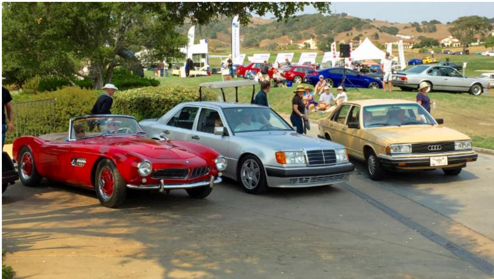
Best of Marque Finalists