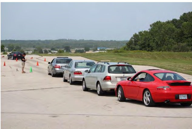
Cars lined up for practice runs