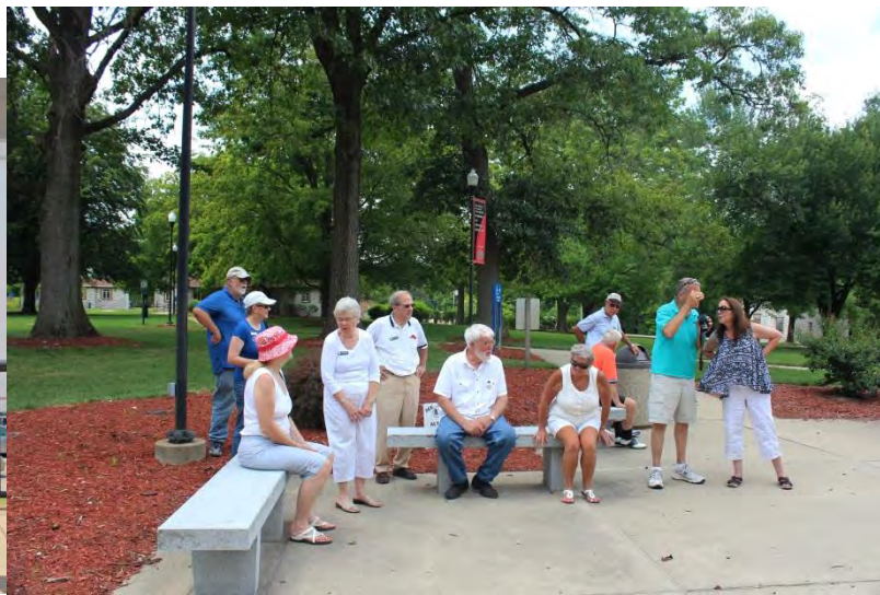
Resting before heading to The Loading Dock restaurant for lunch