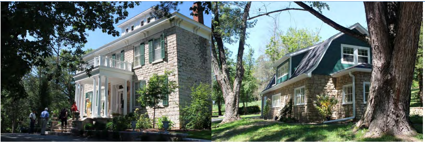
The Mercedes Club arriving for the tour of the beautifully restored Stonecroft Manor and Carriage House