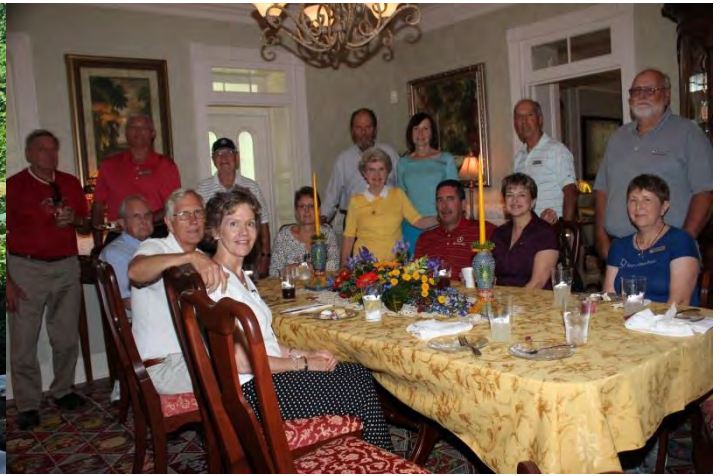
Lunch at Stonecroft Manor