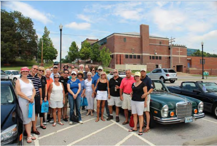
A great turnout for the Alton River Ramble Trip