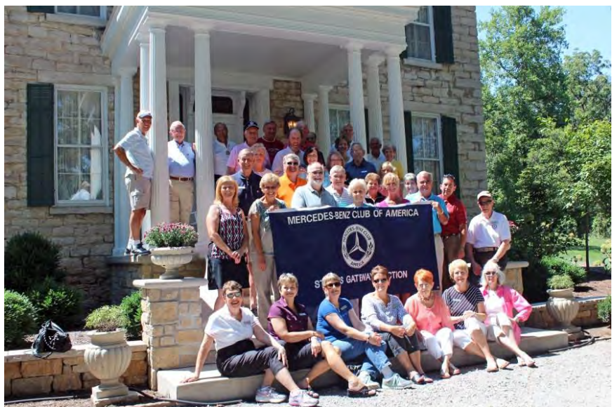
A great turnout for our trip to Hannibal and Stonecroft Manor