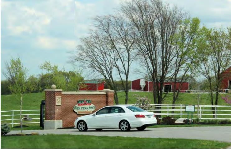
Warm Springs Ranch, Boonville, MO