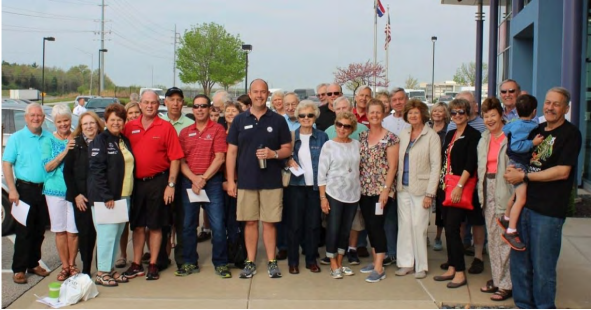
A fantastic turn-out of almost 60 members for the Warm Springs Ranch Tour