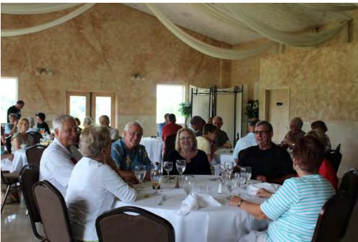
Lunch at Villa Marie Winery