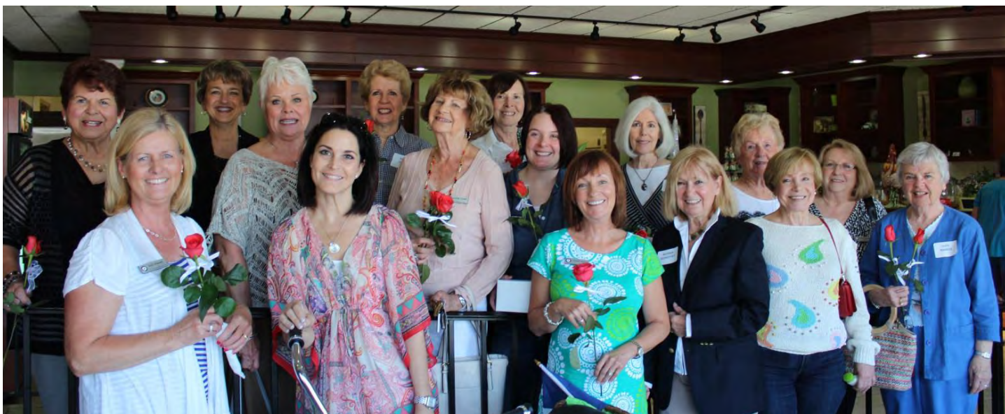
Ladies Luncheon at La Bonne Bouchee