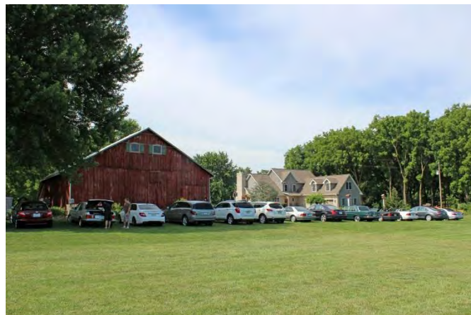
A great turnout for this event!