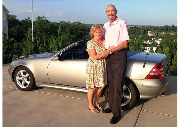
2004 SLK 320

We joined the club a few months after purchasing the car and attended Autos on Valhalla as our first event. Having never been members of a car club in the past, we weren't sure what to expect. What we found were kind and genuine people who made two newbie members feel very comfortable and welcome. I can honestly say that we have enjoyed every event so far and consider ourselves lucky to be part of such an awesome group.