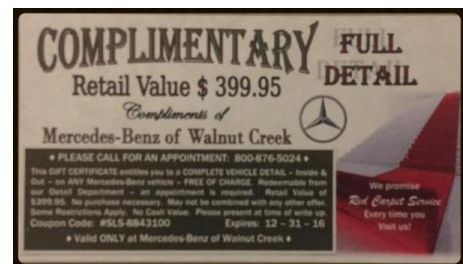
Detail Certificate at MB of Walnut Creek