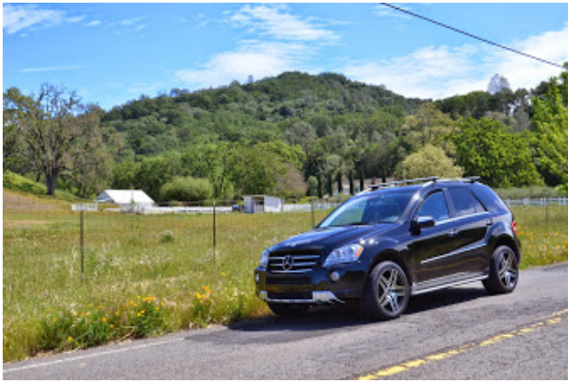
Napa Tour 2015