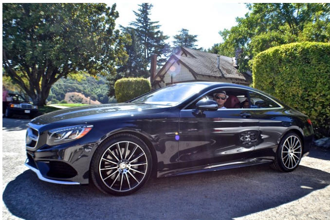
Car Clubber in a Bad Ride 2015