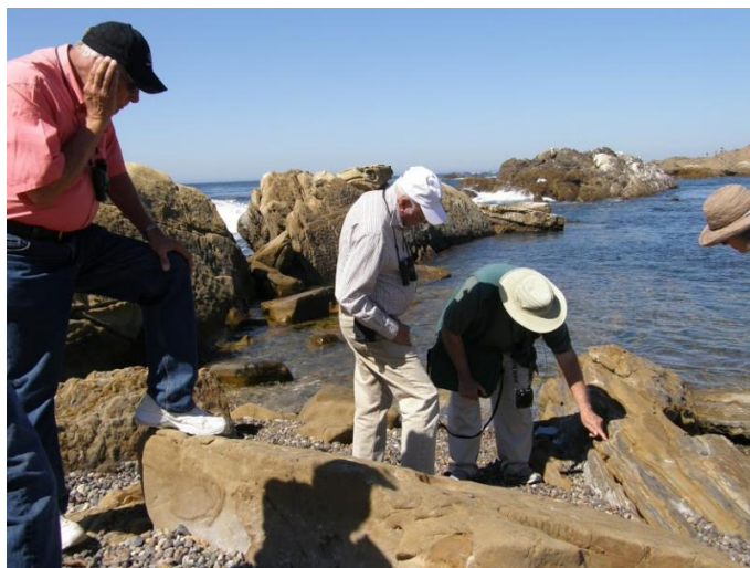
Point Lobos Exploration 2015