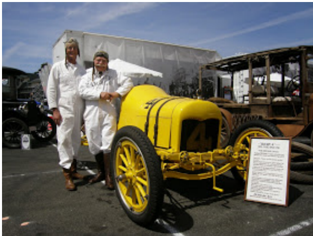
Sonoma Historics 2014