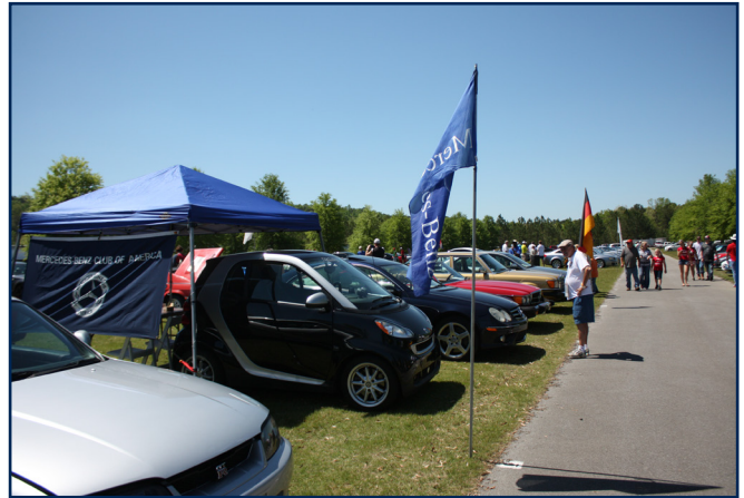
2014 Indy Car Corral at Barber Motorsports Park

Go to barbermotorsports.com for ticket information.