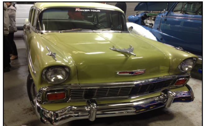
Above left: Alabama Section members' cars outside of Impatient Creations.