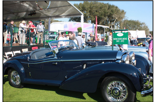
Last years Concours D'Elegance at Amelia Island