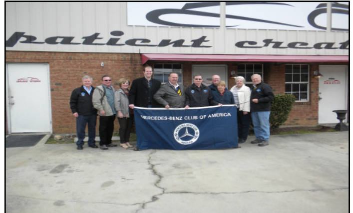
Members gather outside of Impatient Creations