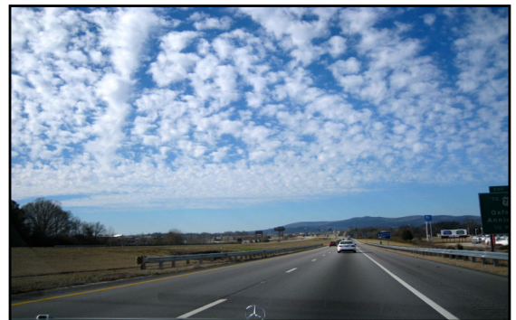
Mt. Cheaha from Talladega Super Speedway

As we set out down Alabama 25 (The Copperhead) the line stretched out a mile or more. From my vantage point at the front of the line I could not even see the last Mercedes-Benz – much less the Porsches or others.