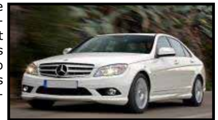
C300 Sport Sedan

What a car this is: just the right feel—like an SL, almost as firm and planted as the “firmest” setting in the S-class without the harshness. The steering has just the right balance and the seats connect you firmly to the car which gives just the right connection to the road.