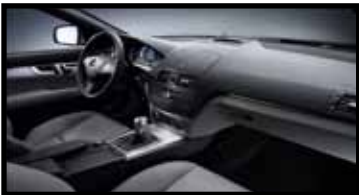
C300 Sport Interior

Inside, the seats have more prominent side bolsters, the wheel rim is fatter, and the wood trim is replaced with brushed aluminum.