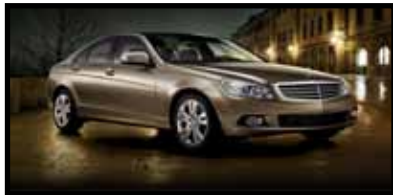
C300 Luxury Sedan

As things have evolved, BMW has become more luxurious while Mercedes-Benz has become more sporting—and not just the AMG models. Still the perception has been that while the three pointed star represents the highest engineering standards, the cars do not generate the passion in younger owners that BMW and Porsche do.