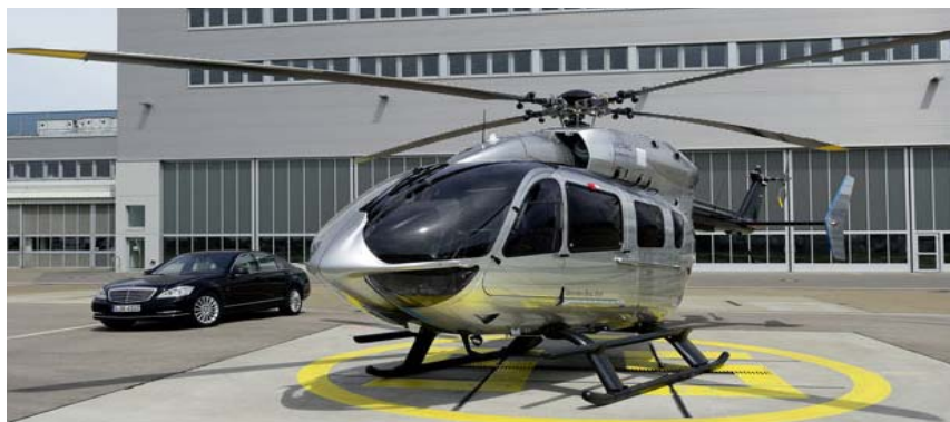
"Hey Honey, our ride is here!"

Who wouldn't want to fly Benz? Have a business lunch out of town or an event that just can't wait? Why not head out back or to your local airport to fly and arrive in style?