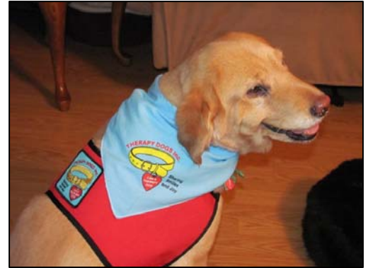
Emily of the CHOP Pet Therapy Team

With this announcement, I am pleased to introduce “Emily”, one of MBCA – SJS’s pets working to become part of the Pet Therapy program at CHOP. Emily who herself is a rescued golden retriever went through the necessary training and is now a registered therapy dog through “Pet Therapy Inc.” and is awaiting her application approval to become part of the PAW PARTNERS team with CHOP.