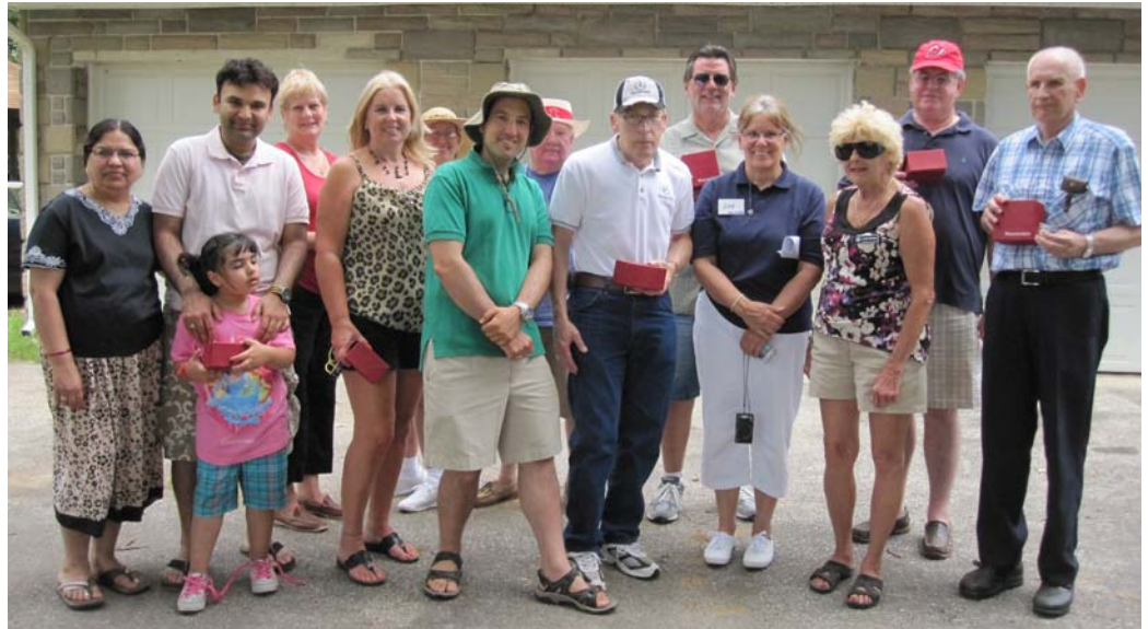
2011 Picnic & Show Award Winners—For a complete listing, check out Page 6!