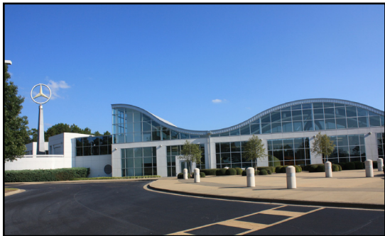
MBUSI Factory in Vance, AL

Of course, StarTech 2013 will have multiple technical seminars by nationally recognized experts as well as some surprising locals that you may not be familiar with. These will take place in the Mercedes-Benz US International Training Center adjacent to the factory.