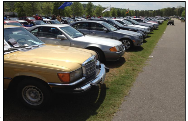
Members star cars at the 2011 Indy Car/Grand Am Car Corral

T he indy car race is coming to the Barber Motorsports Park Friday, April 5 through Sunday, April 7, 2013. The Mercedes-Benz Club of America- Alabama Section has supported this race by displaying their Star Cars in the Car Corral. The Alabama Section has also supported this race by volunteering to help in the car corral. You are encouraged to park with other car enthusiasts in the car corral and to volunteer to help in the car corral.