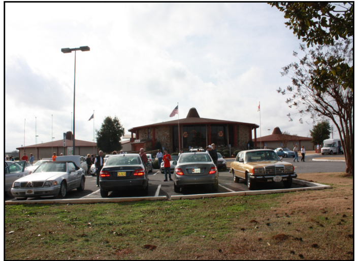
Members gather at the Motorsports Hall of Fame Museum in Talladega

Our first stop was the Motorsports Hall of Fame Museum at the Talladega Superspeedway. We skipped the town of Talladega and the Talladega Mountains until we could follow 77 south of the mountains all the way to the time warp Clay County seat, Ashland, which looks exactly as it did 100 years ago around the courthouse. I can remember purchasing my license plates there years ago to get "17-220" or "17-911". This was long before vanity plates. You just walked into the office in the basement in the first few days to get "220" and came back in a couple of weeks for "911" which I asked the clerk to save.