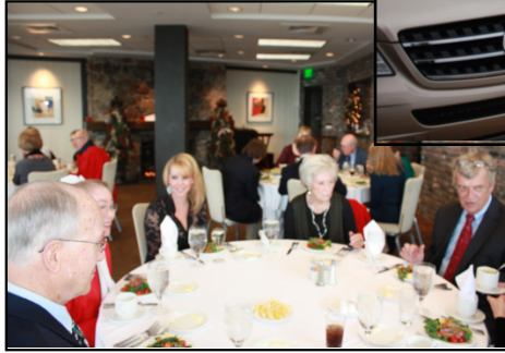
Top: Members star cars at The Club.

The food and the conversation were great as excitement builds for hosting StarTech 2013 on 18-22 May, 2013.