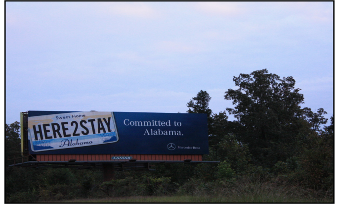
Billboard approaching MBUSI factory

The U.S. Space & Rocket Center & N.A.S.A in Huntsville, AL will be a featured part of Heimatfest/StarTech 2013. Try to arrive by 10am or at least by 1 pm on Saturday 18 May for the special MBCA tours of this world class facility.