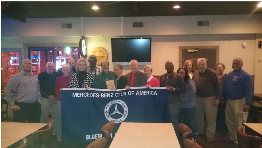
The Holiday Dinner is always one of our best turnouts. It's great to see everyone.