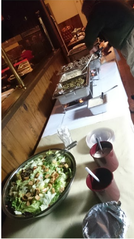
Plenty of food was on offer, no one left hungry