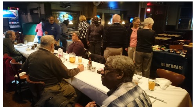
Dinner being served