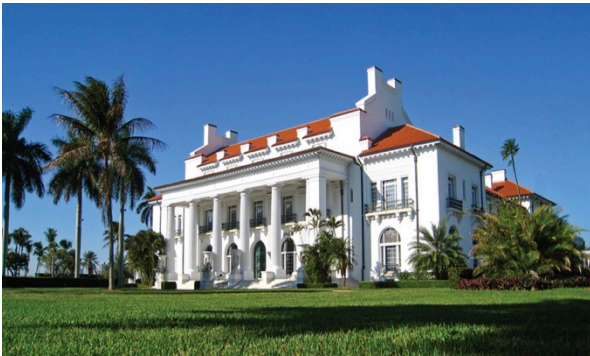
Flagler Museum One Whitehall Way Palm Beach, FL

Touring A1A – Palm Beach to Boynton Beach