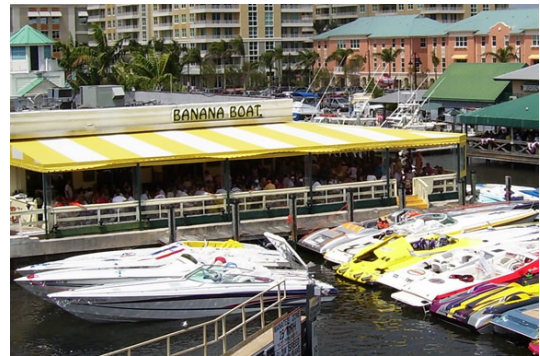
Banana Boat 739 E. Ocean Blvd. Boynton Beach, FL

We'll plan to meet at 10:00 am on Saturday morning, April 25 at the Flagler Museum. The museum is located at One Whitehall Way, Palm Beach, FL. We'll depart and drive south for about 17 miles on beautiful A1A along the ocean and wind up at the Banana Boat Restaurant in Boynton Beach for lunch and a "typical" Road Star "business" meeting. Lunch will be from their normal menu and everyone pays their own way. This will be a magnificent drive along some of Florida's most beautiful real estate. We hope to see you all there.