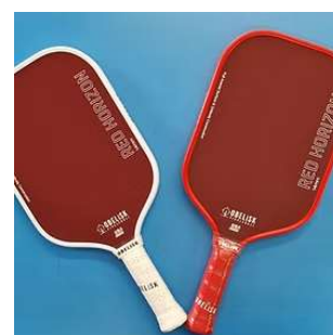
Red Horizon $189