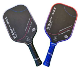
Horizon III Gen3S $249

Use BRIAN10 for a 10% discount on your order