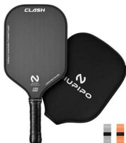
Clash (T700 1 Piece Design Carbon Fibre) $175