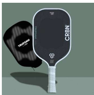
CRBN 3 TruFoam Genesis (Elongated) $436.00