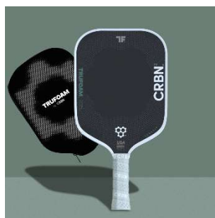
CRBN 2 TruFoam Genesis (Square) $436.00