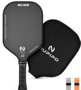
Glide (T700 Carbon Fibre) $175