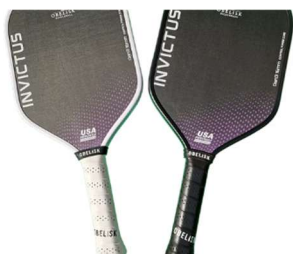
Invictus III Gen3 $249