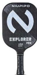
Explorer Pro (Graphite) $120