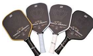
Triple Crown Gen3 $249