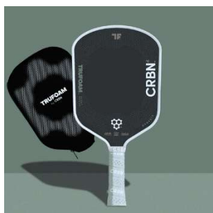
CRBN 4 TruFoam Genesis (Hybrid, Aerocurve) $436.00

Use BRIANCRBN for a 10% discount on your