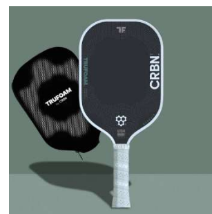
CRBN 1 TruFoam Genesis (Elongated, Long Handle) $436.00