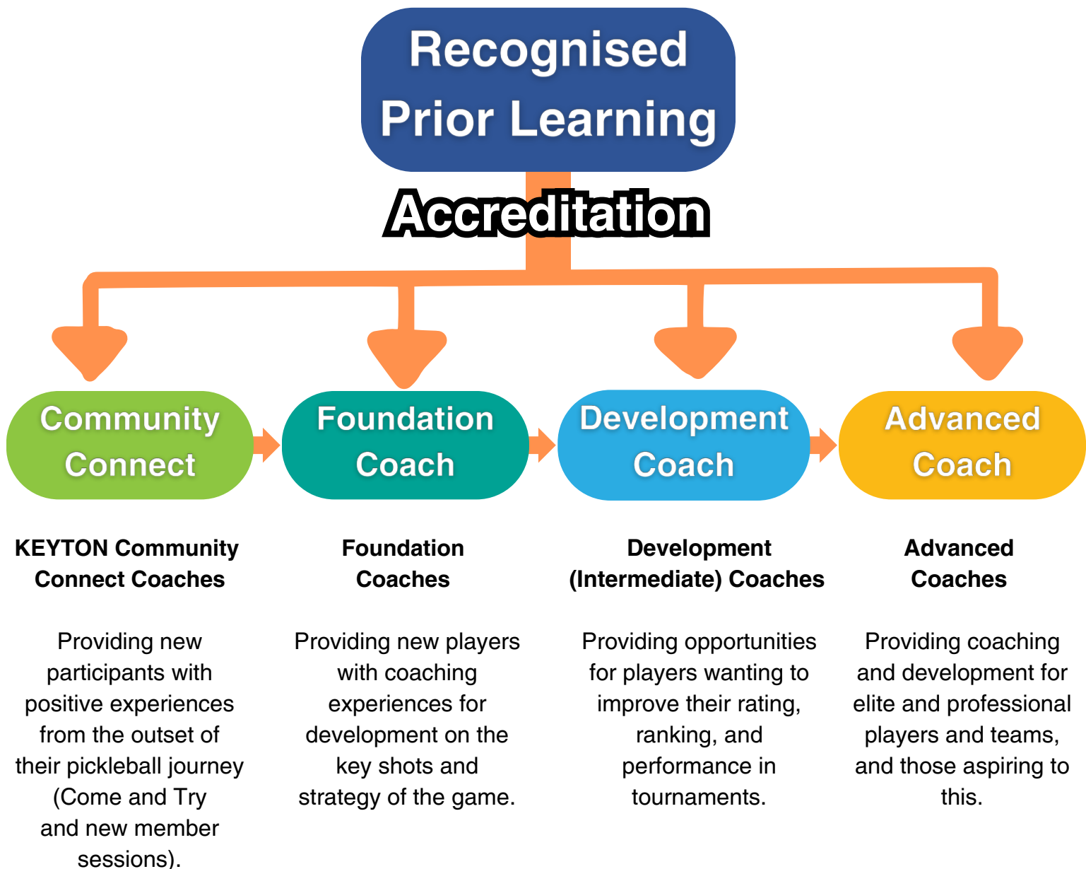
Fig 1. PA Coach Pathway Opportunities

Central to the PA Coaching framework is the establishment of four types of coach: