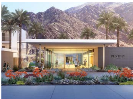
La Quinta (coming 2025)