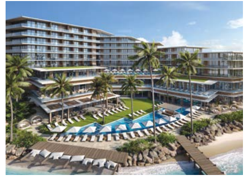
Barbados (coming 2026)