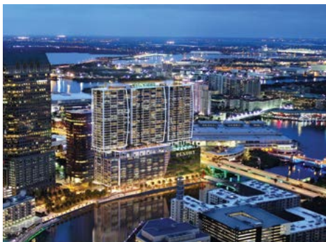
Tampa Bay (coming 2025)