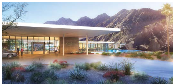
La Quinta (coming 2024)