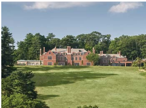
Natirar (coming 2024)