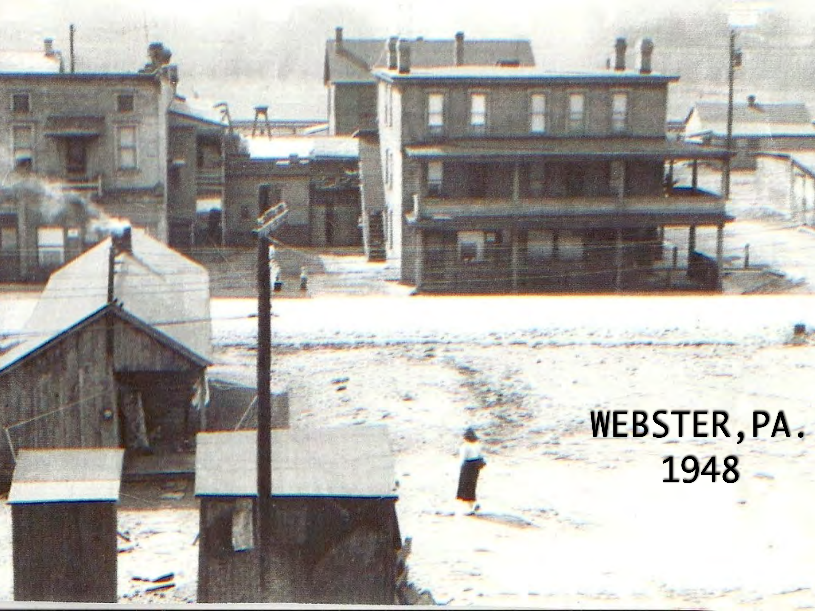
WEBSTER, PA. 1948