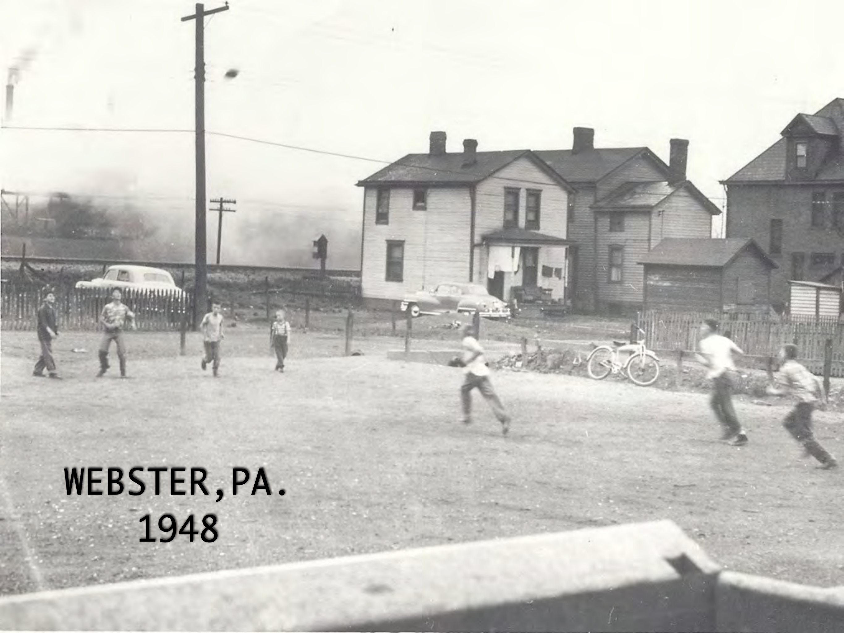
WEBSTER, PA. 1948