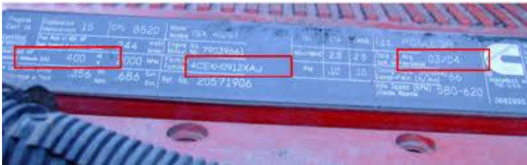
Cummins Engine Example