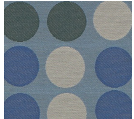
008 Ecu and Royal