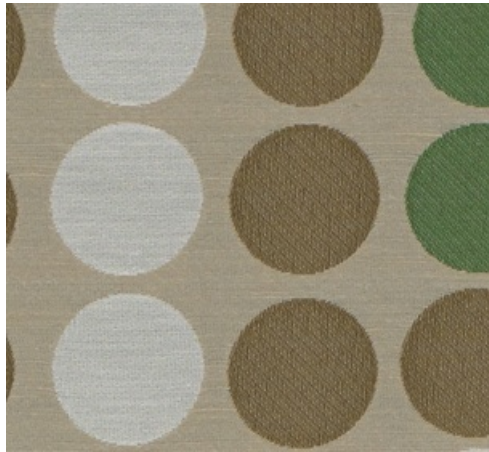
005 Emerald and Ochre