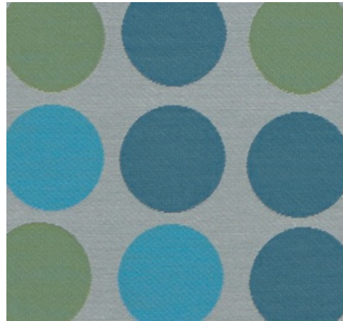
007 Turquoise Light and Green