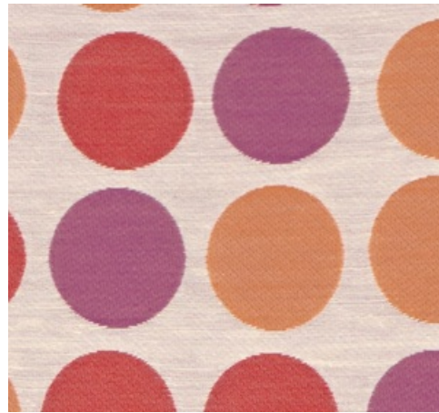
003 Red and Purple