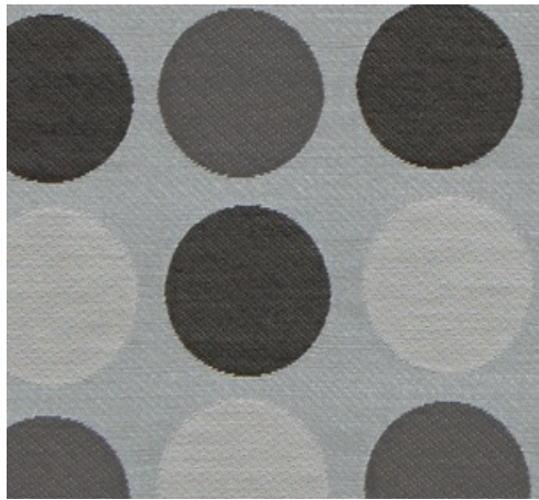
001 Gray and Black