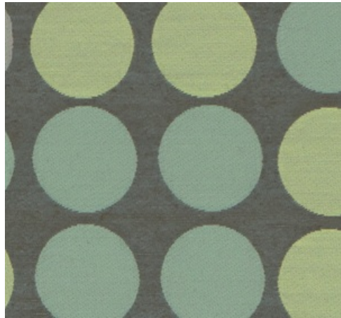
006 Avocado and Gray Blue