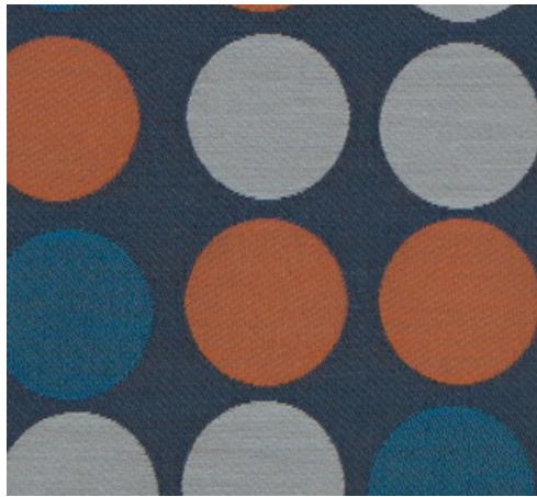
009 Turquoise Dark and Orange