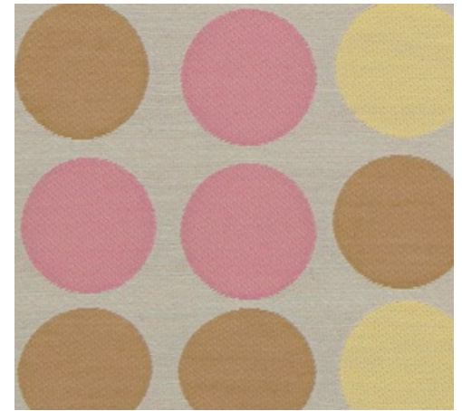
004 Pink and Yellow