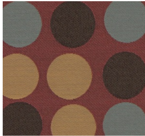
011 Sienna and Madder

466475 Circles by Alexander Girard, 1952