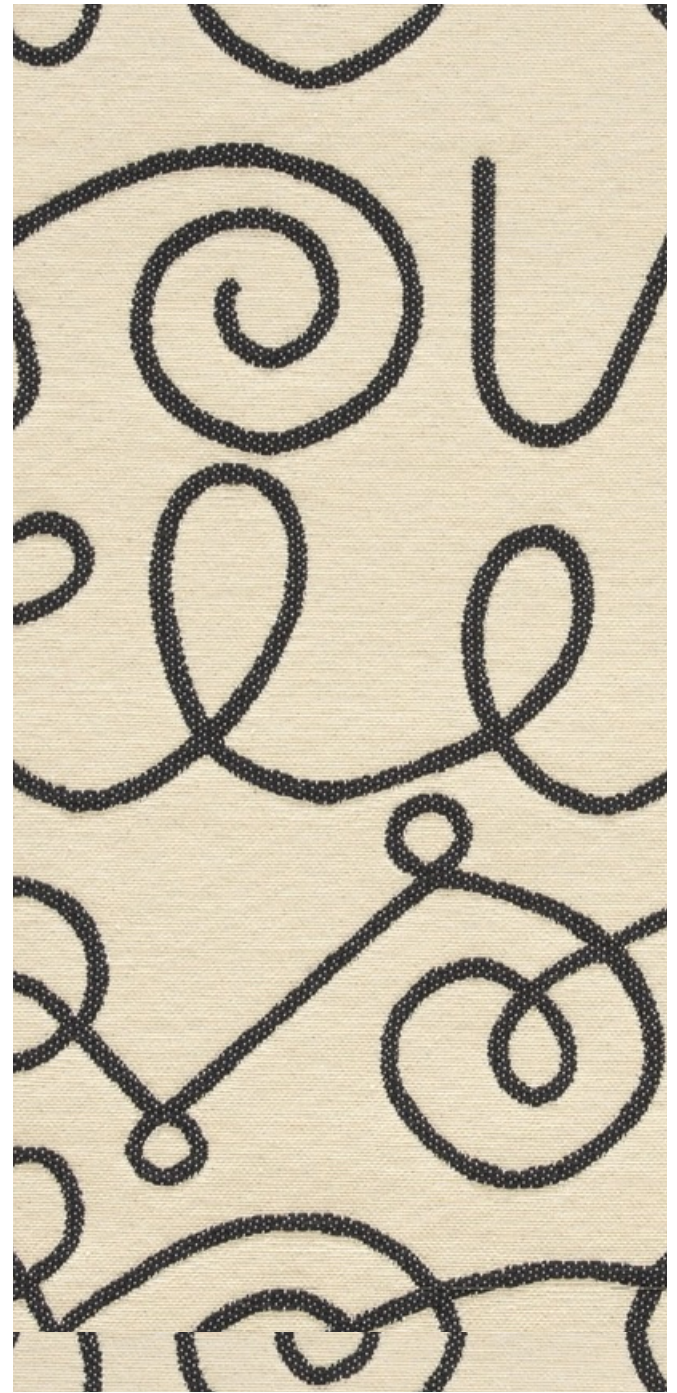
003 Black On White