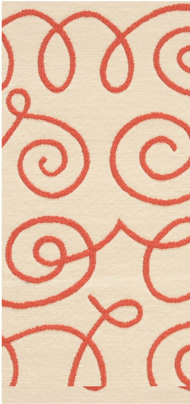
001 Crimson On White