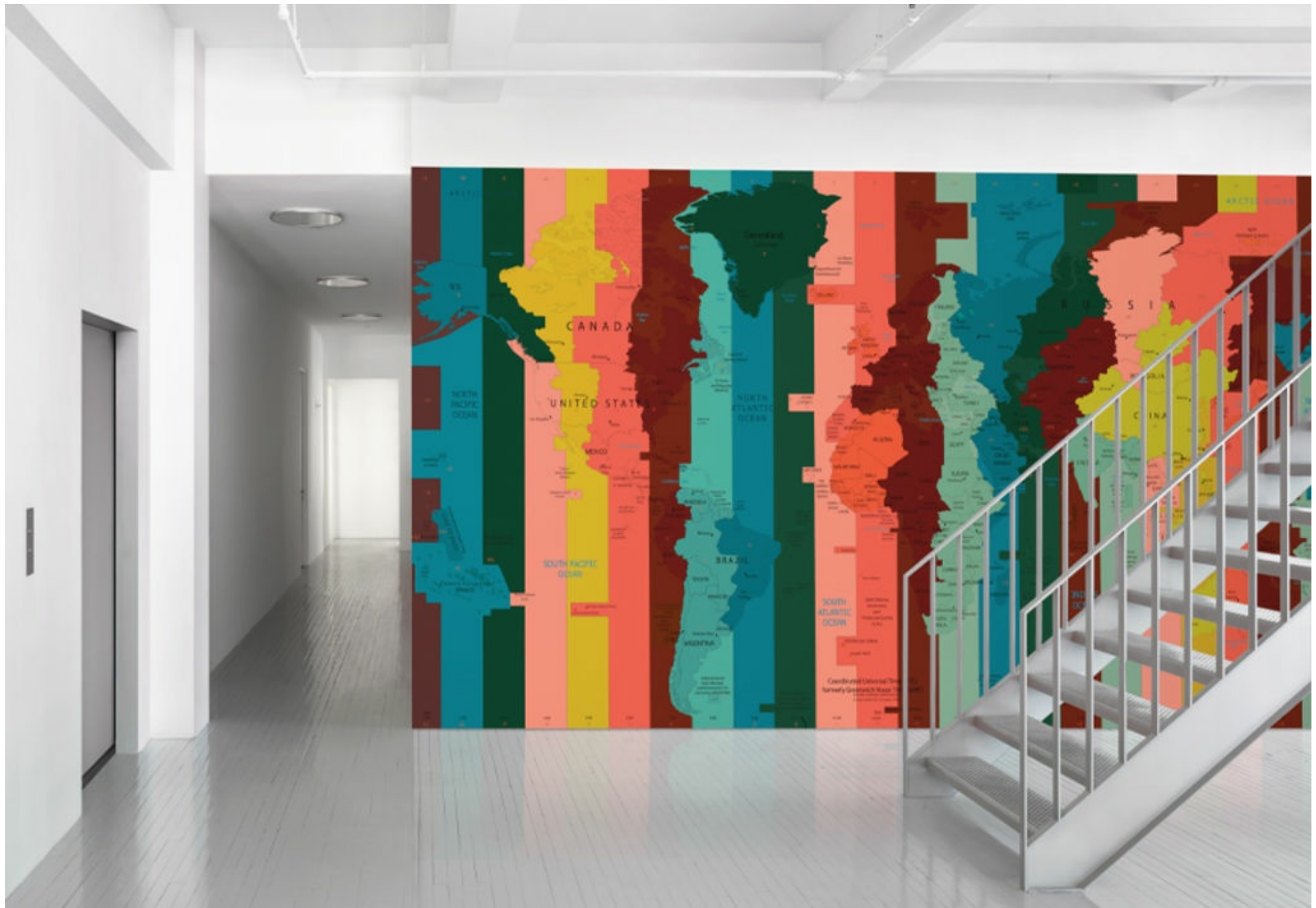
399988 Artist Stripe World Time Zone