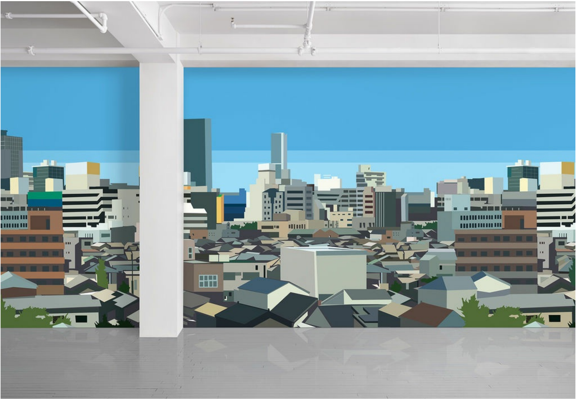
399968 Endless City