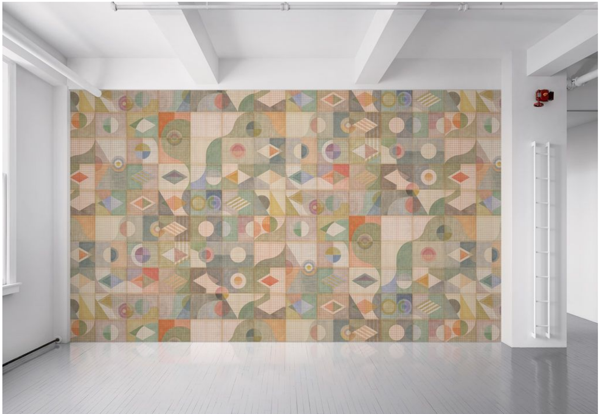
399942 Pure Potential No. 1-4