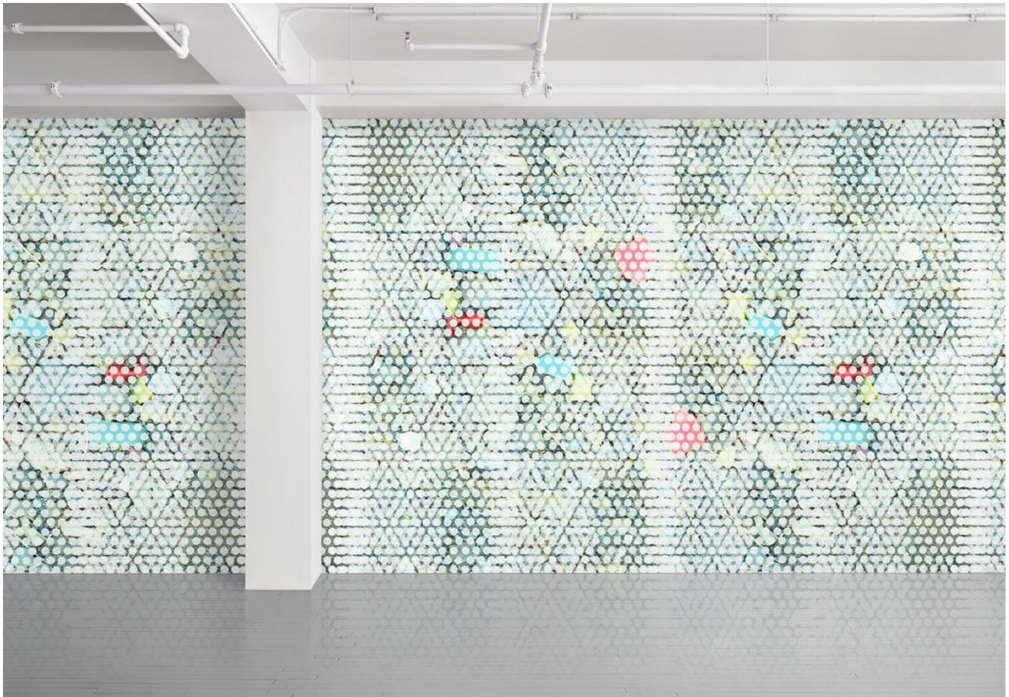
399610 Screen (Shoreline Debris)