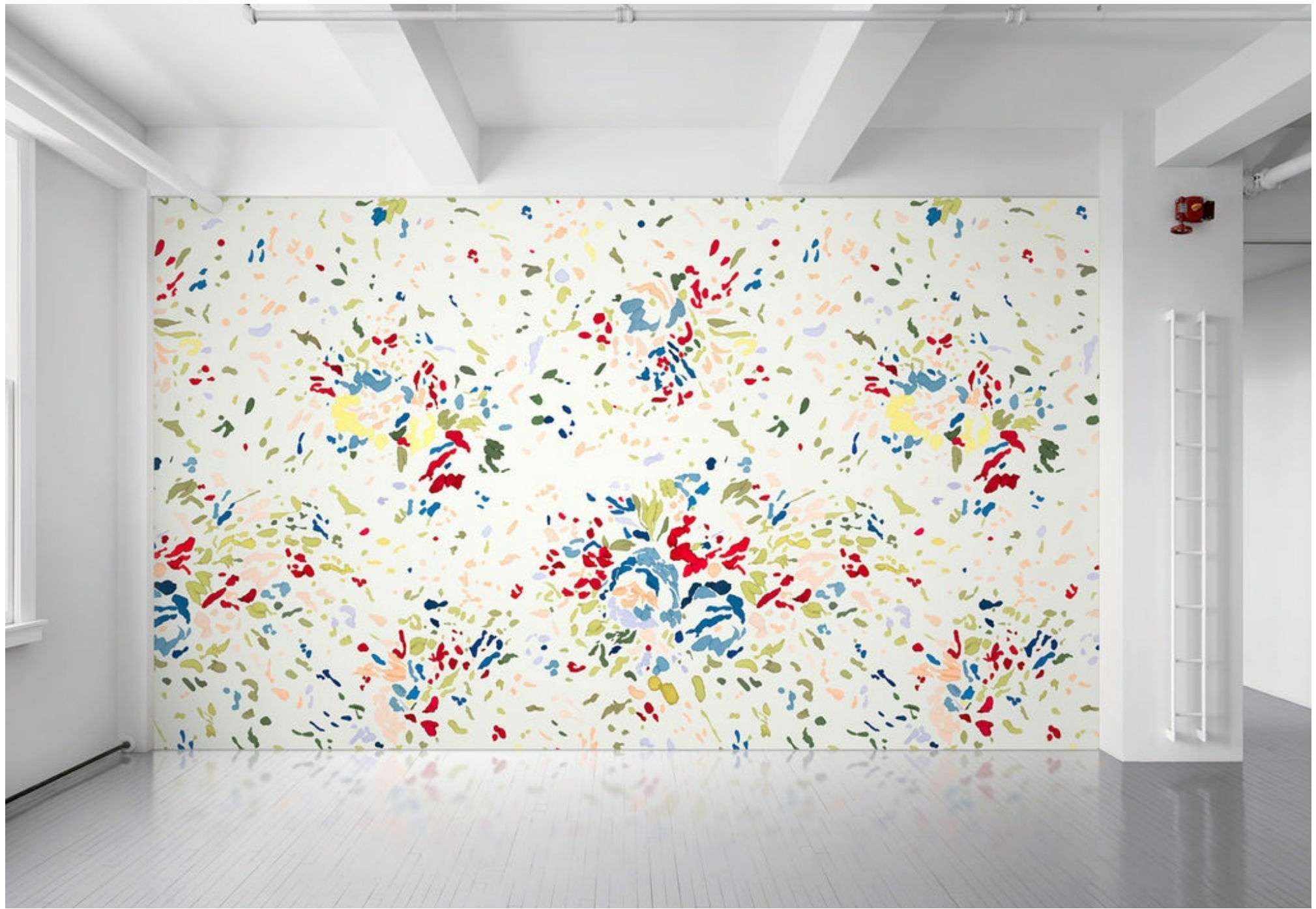
399596 Inky Flower