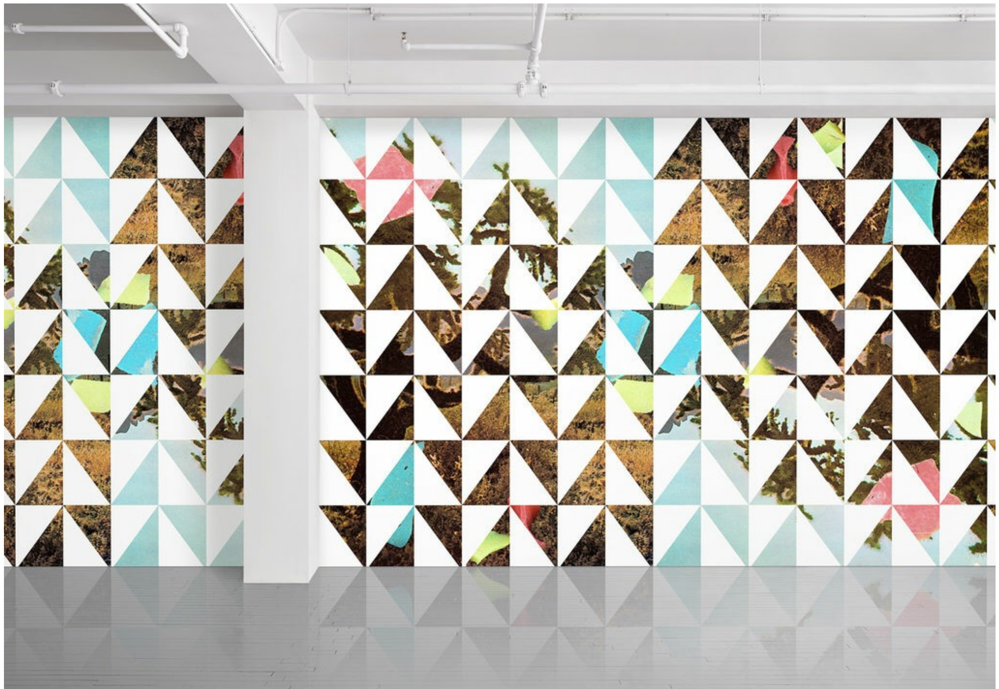
399585 Screen (Double Desert Inverted)