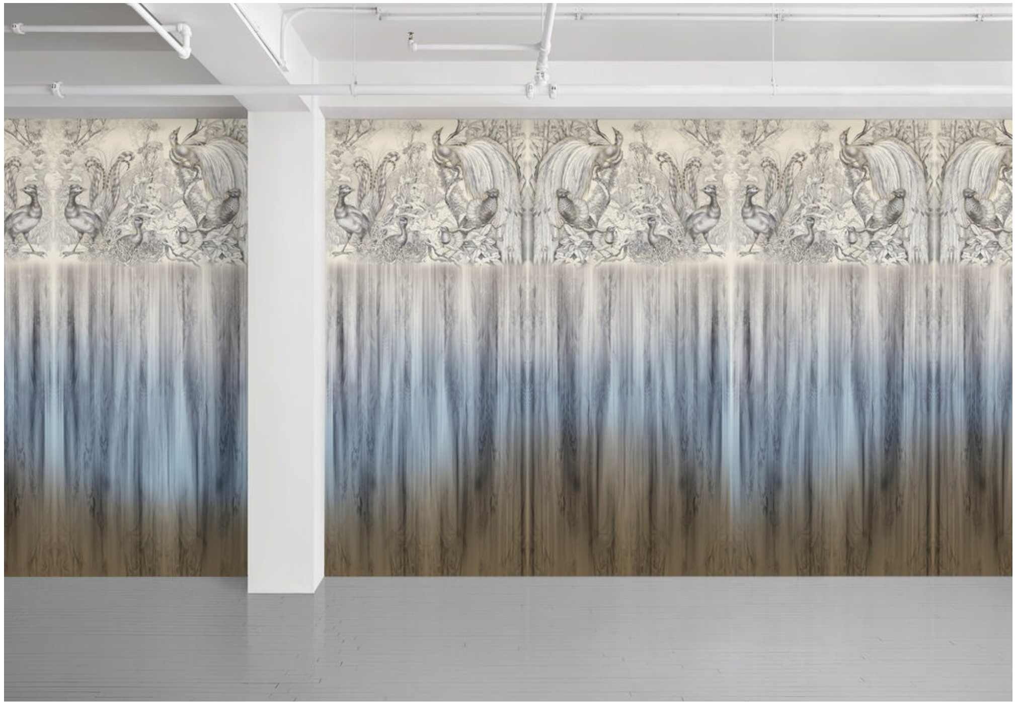
399574 Birds of Paradise