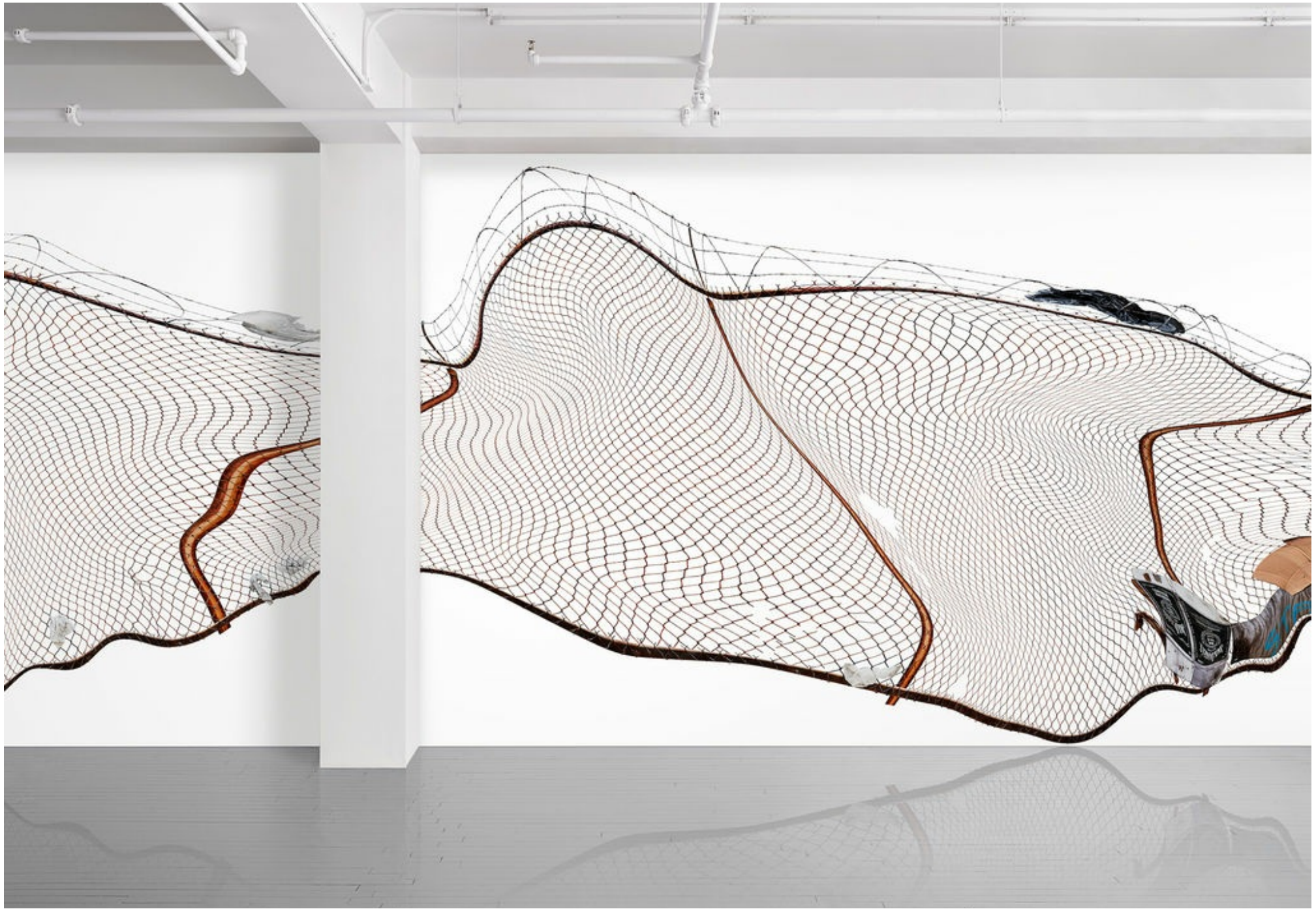
399553 Chain-Link Fence