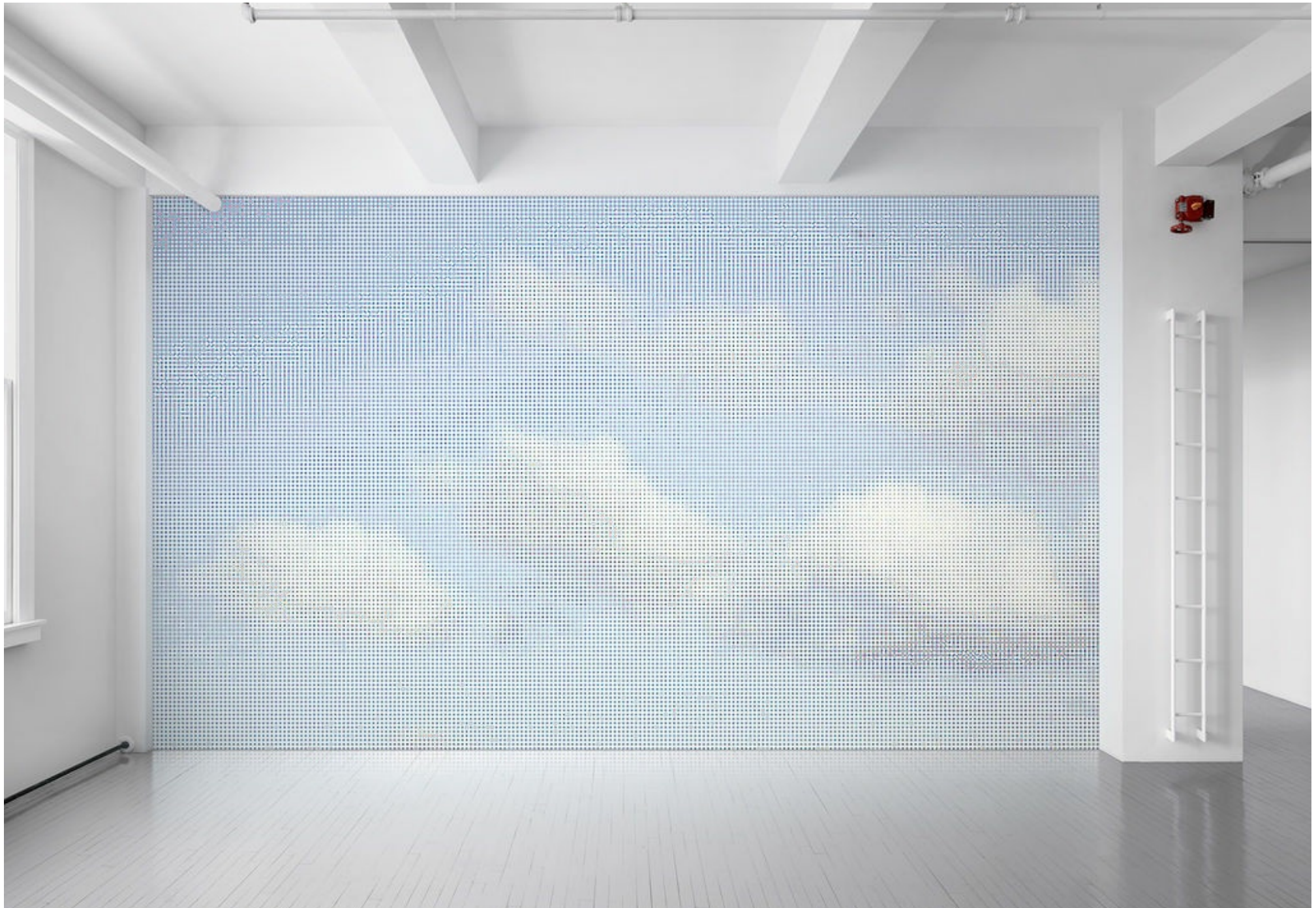
399440 Dutch Clouds