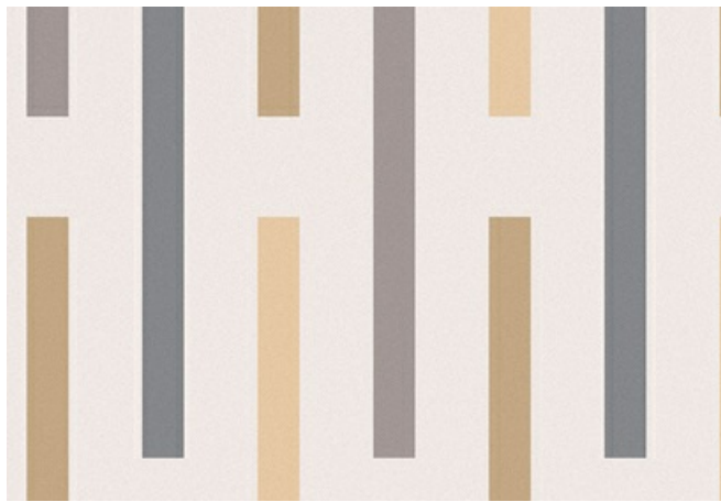
001 Ochre and Blue Gray Light