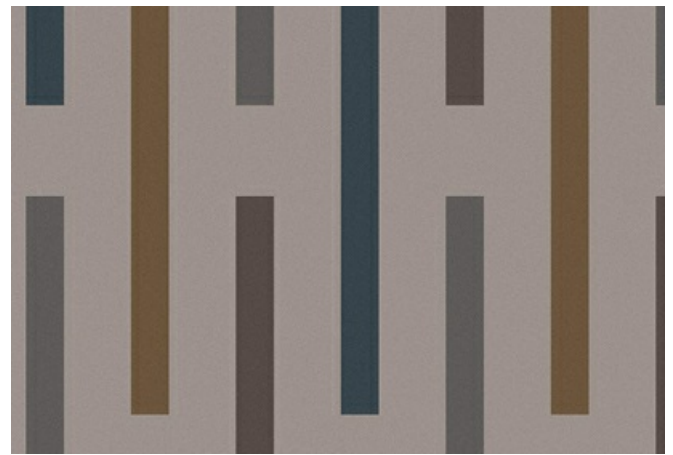
009 Madder Brown and Sepia

300091 Broken Stripe by Alexander Girard, 1952