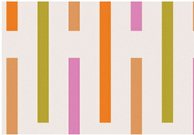
004 Pink and Orange Light