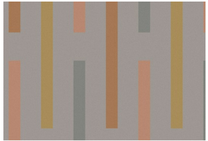
006 Peach and Raw Umber