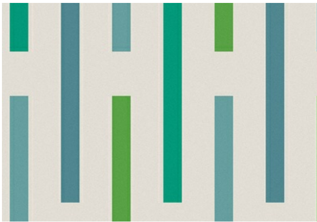
002 Emerald and Turquoise Light