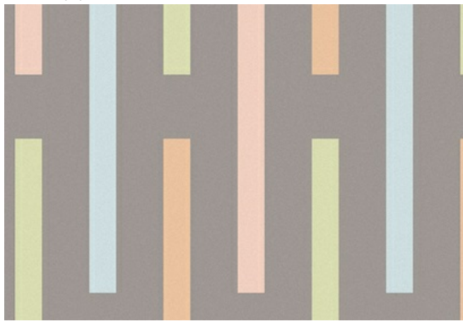
007 Crimson White and Yellow Light