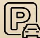
Indoor Parking ($)