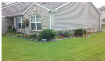
Lawn mowed and weeded