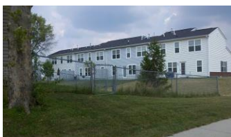
Needs weeded at fence line