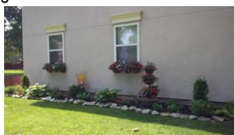
Flower beds maintained