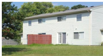
Lawn needs mowed and weeded