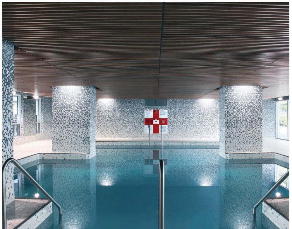
Photography by Rick O'Brien