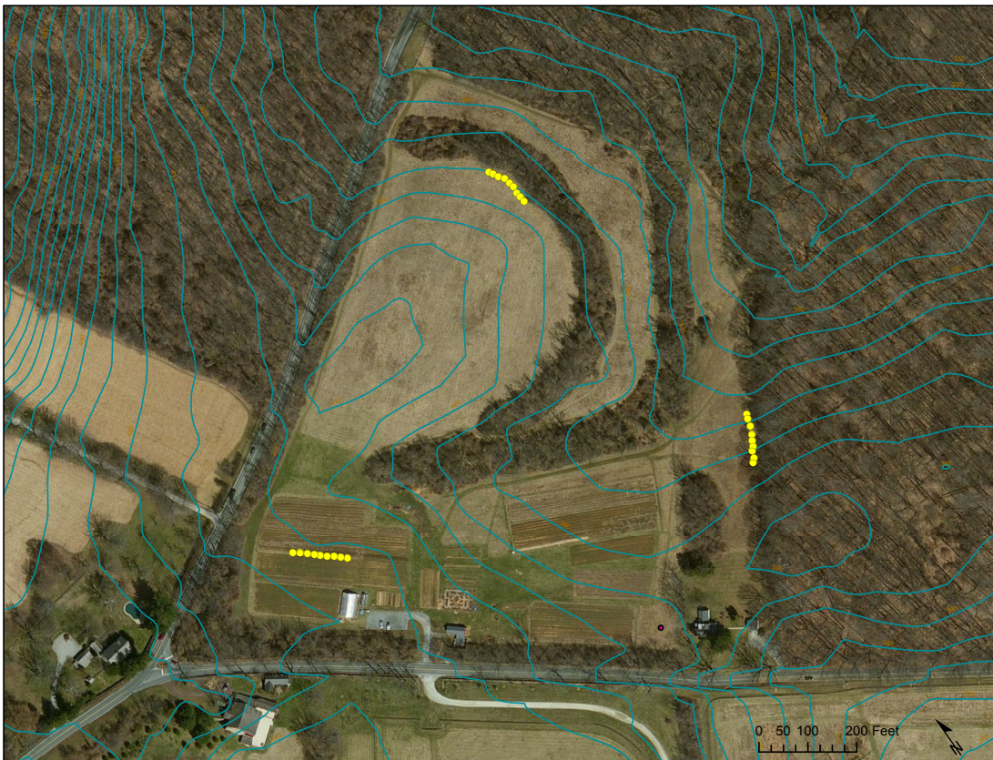
Figure 1. Bee Survey at Rushton Farm. Glycol Pan Traps deployed in 3 areas around the farm. Locations, surveyed with Trimble GPS device and mapped in ARCGIS, include: amongst crops, near Rushton Woods, along a hedgerow.

USDA Bee Laboratory in Beltsville, MD, offered a great deal of assistance with the design of the study, in terms of how to construct and deploy the traps, answering general questions, and also was kind enough to offer to teach the author how to identify and classify bees in the lab. Pollinator specimens were collected ten times from the pan traps between 5/17/12 and 8/28/12 and stored in refrigerated Whirl Packs in an Alcohol solution. Netting was also conducted on 7/13/12. GPS mapping and GIS digitization of the test site were carried out on 6/8/12 using a Trimble GeoExplorer (see Figure 1). The collected bees were sent off to the USGS Bee Inventory and Monitoring Lab in Beltsville, MD where Sam Droege oversaw the identification and pinning (see Table 1).