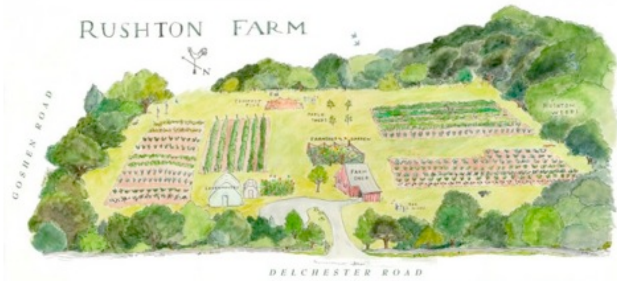
Figure 3. Rushton Farm. A model sustainable farming operation, and a prime example of an agro-ecosystem which has improved pollinator-plant linkage, is located approximately 20 miles west of Philadelphia in Willistown Township, Chester County, Pennsylvania. The Willistown Conservation Trust--a champion of open space preservation, protection, and resource management--established the six acre sustainable Rushton Farm in 2008 on the site of a former fox hunting preserve (Willistown Conservation Trust: http://www.wctrust.org/?page_id=91 )

Organic and sustainable farming methods have been evolving alongside conventional agriculture by working to enhance the soil naturally. Whereas the latter aims to maximize yields per acre, sustainable agriculture seeks to work within and improve the local landscape: