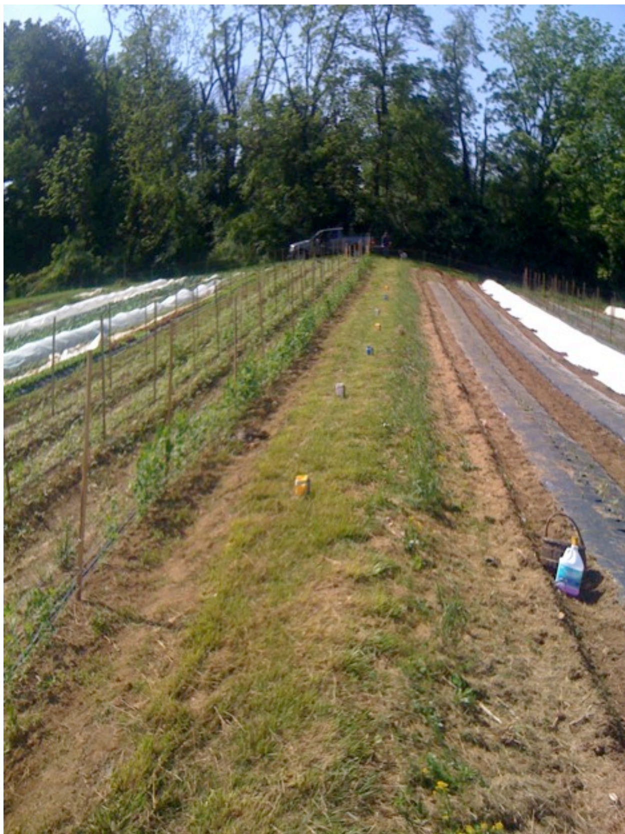
Figure 6. Growing Field Glycol Pan Trap Array at Rushton Farm