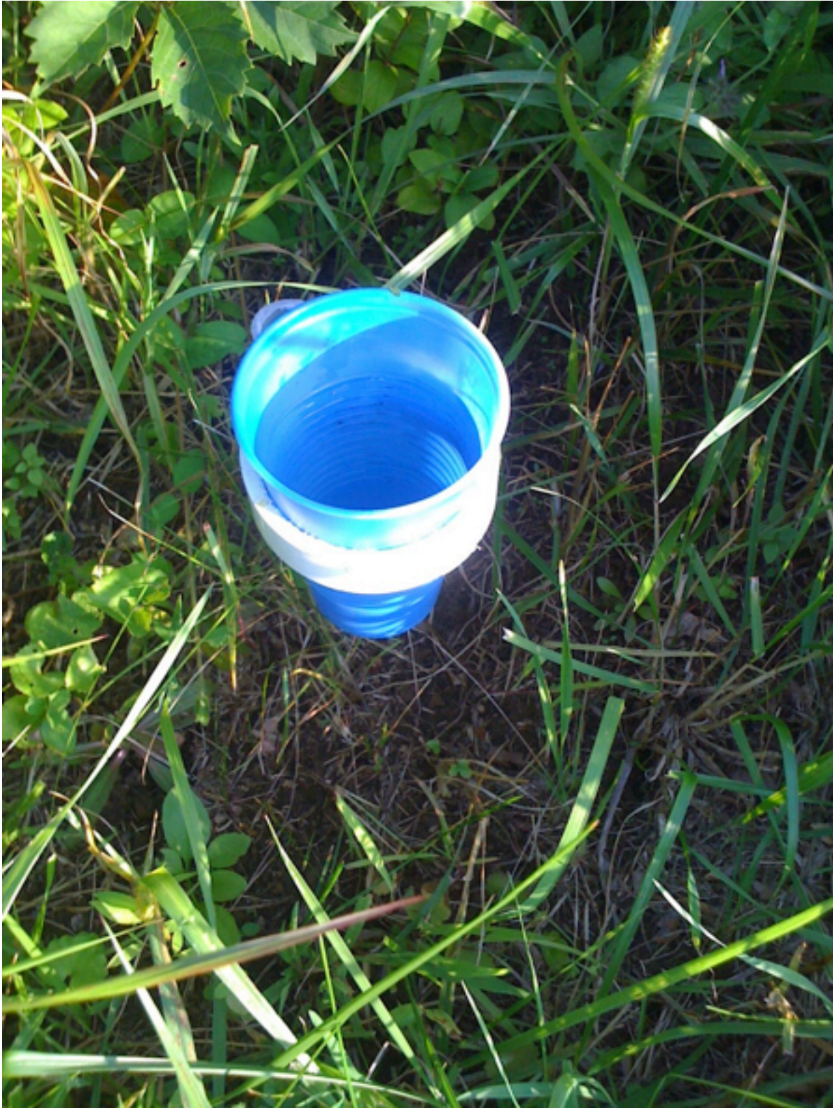
Figure 4. A Glycol Pan Trap, over 30 of which were constructed and deployed