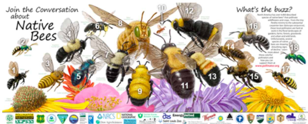
Figure 2. Various Native Bees (Pollinator Partnership)

Native pollinators have been found to be capable of providing pollination services for crops that had previously been pollinated by commercial honey bee colonies and a study by Winfree (2008) of wild bee pollination found that wild bees provide the majority of crop visitation for the study areas in New Jersey and Pennsylvania and the study suggested that maintaining diverse bee communities can provide more complete pollination services, thus increasing plant productivity (Winfree, 2008) (see Figure 2).