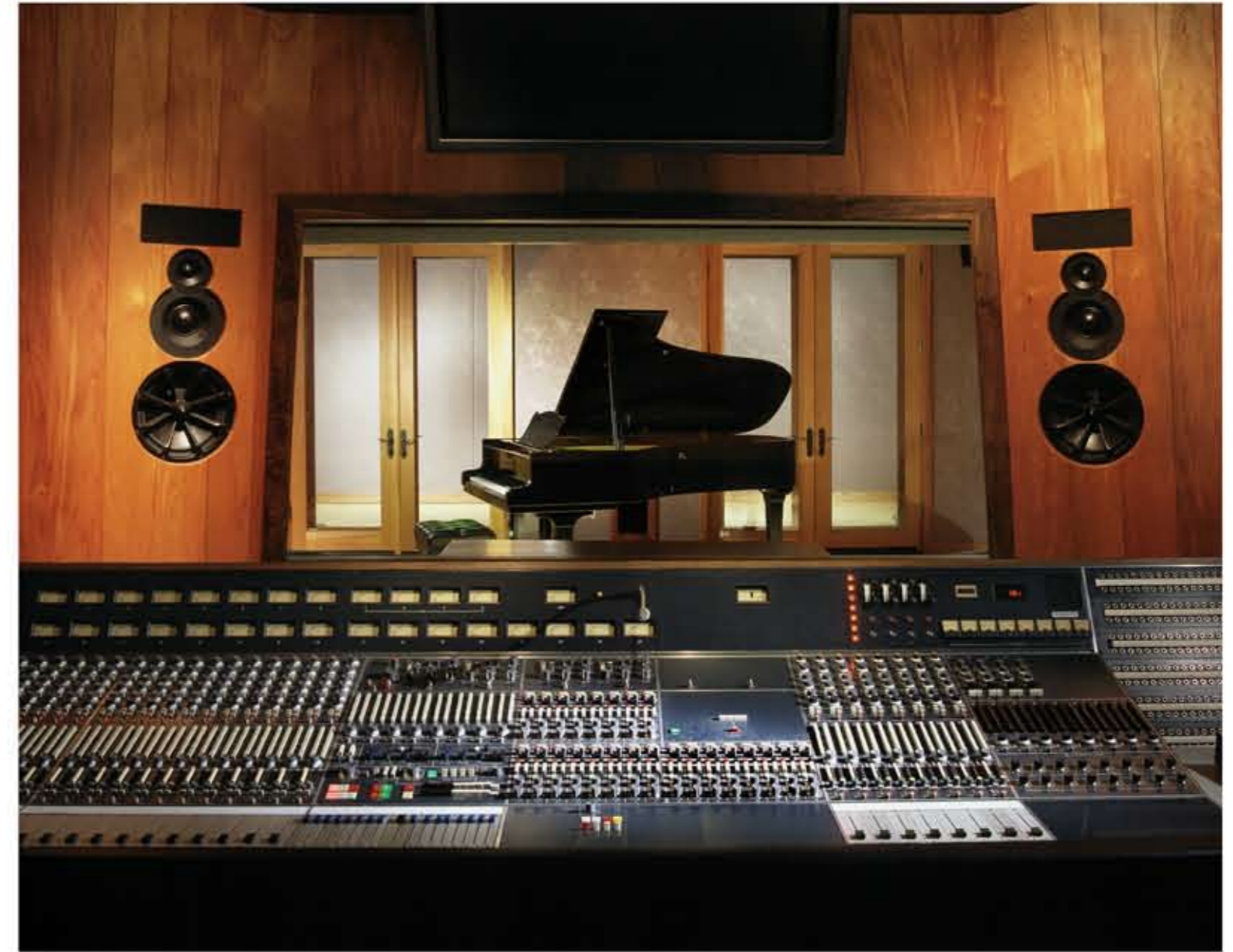
"Fantastic place! Fantastic vibe! Great sound!" -Tom Kenny, editor of Mix Magazine