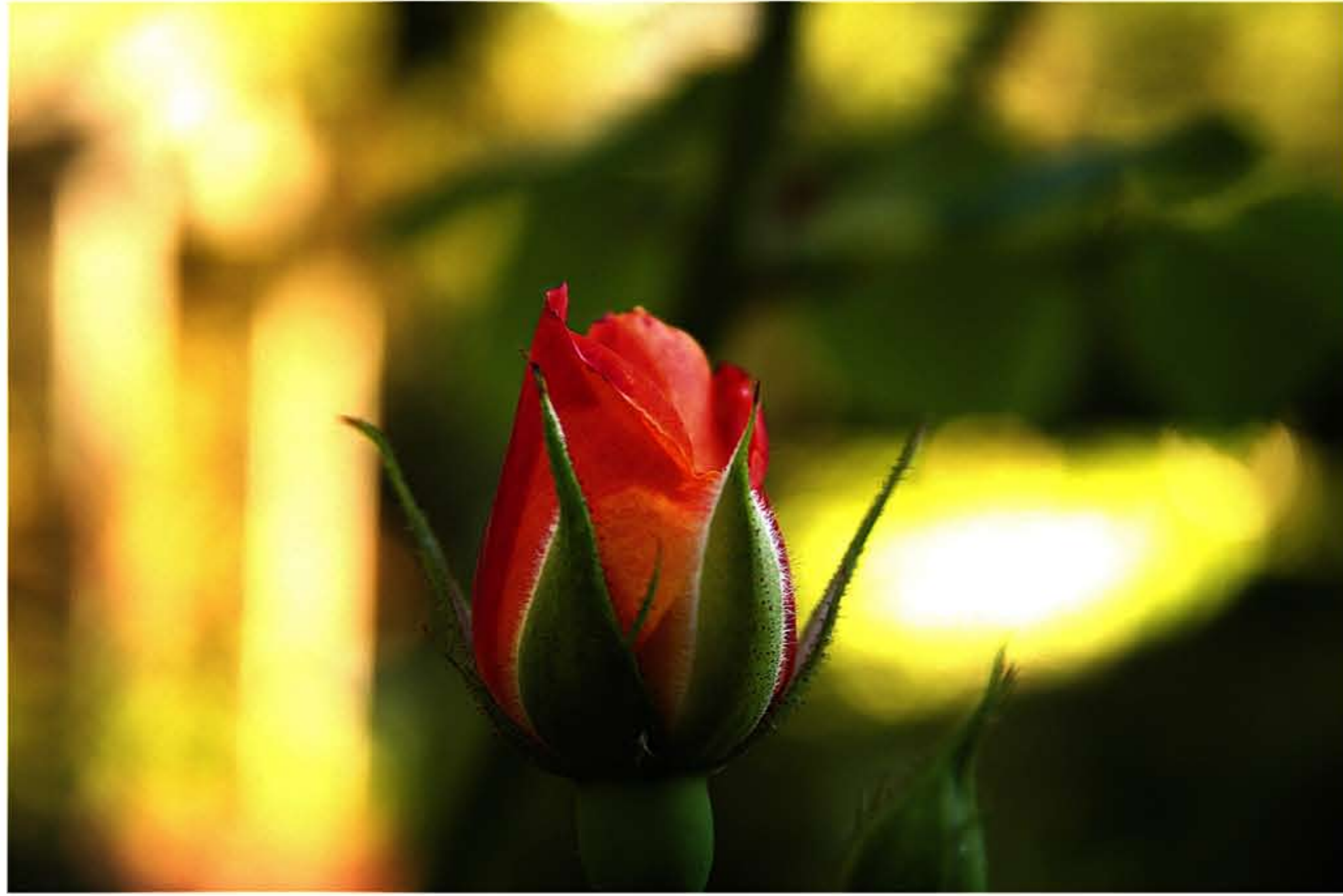
...the abundance of flora and fauna in a vast array of colors for all seasons...