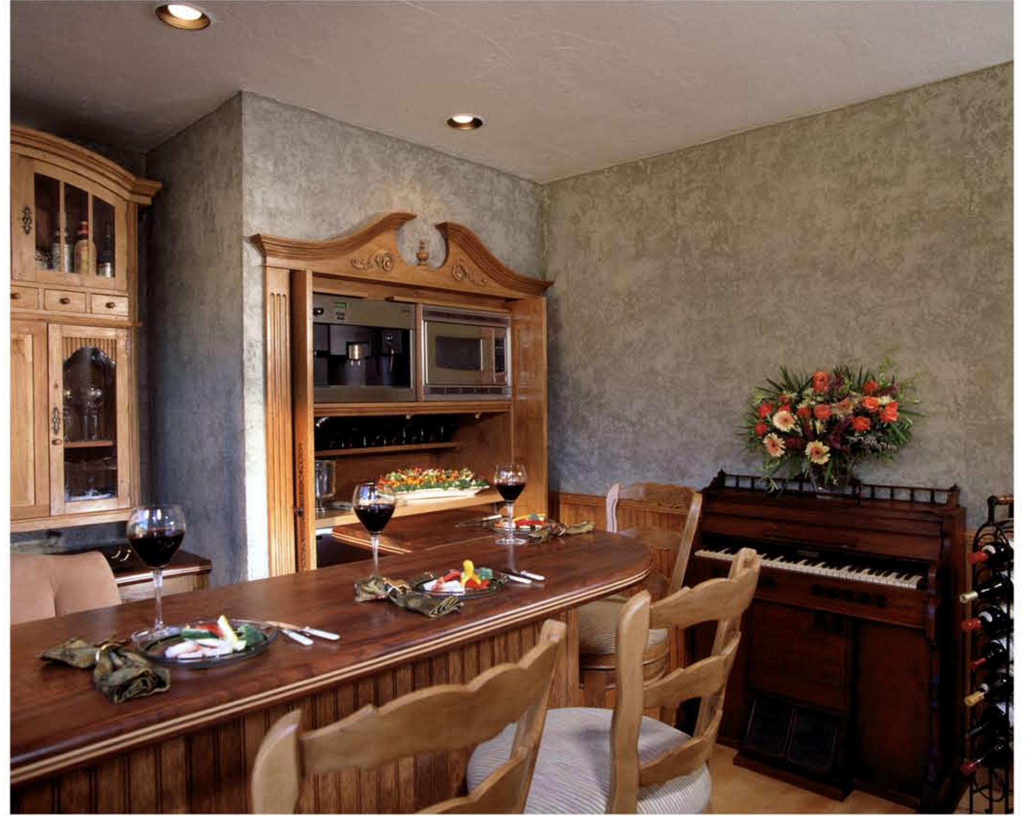
... special feature cabinetry, furniture and accents throughout the studio are made from hand-chosen lumber milled from one of the Black Walnut trees that stood on the estate property for over 100 years...