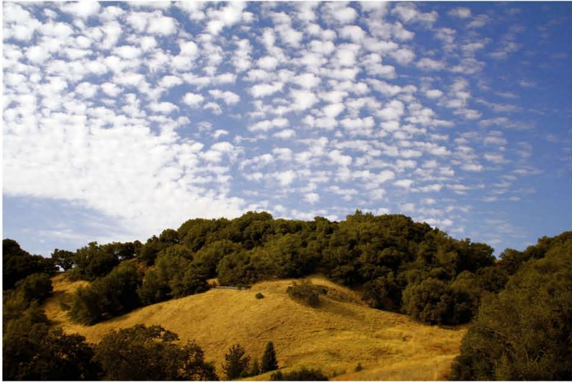
...the picturesque setting of Sonoma Mountain and the endless range of light...