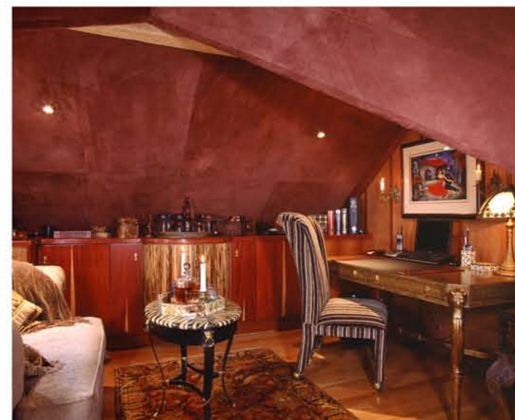
From the main master suite, a wall opens to access the plush Secret Room.