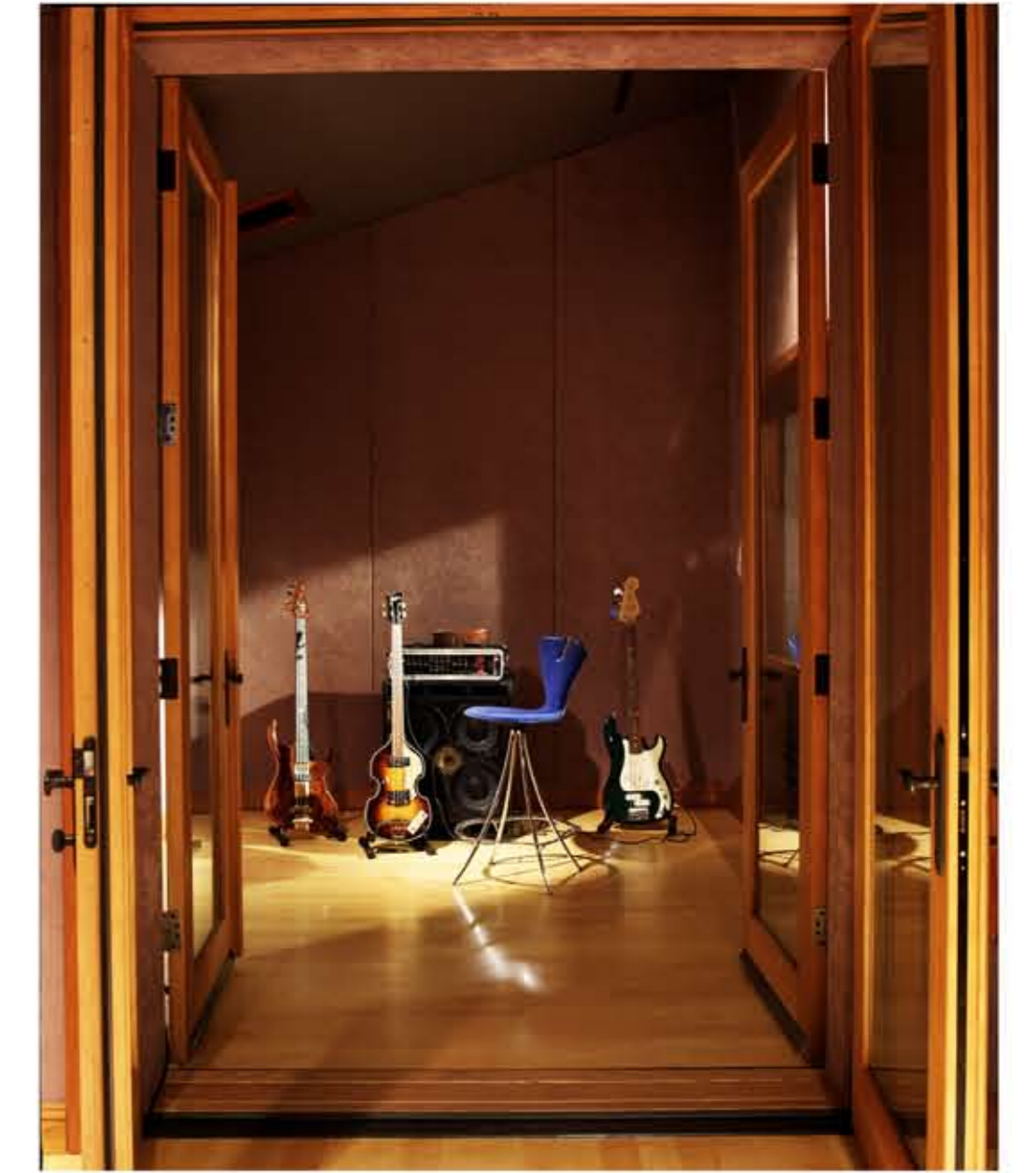
The Platinum and Gold Record award-winning studio has been a creative inspiration for celebrity artists and producers from around the world.