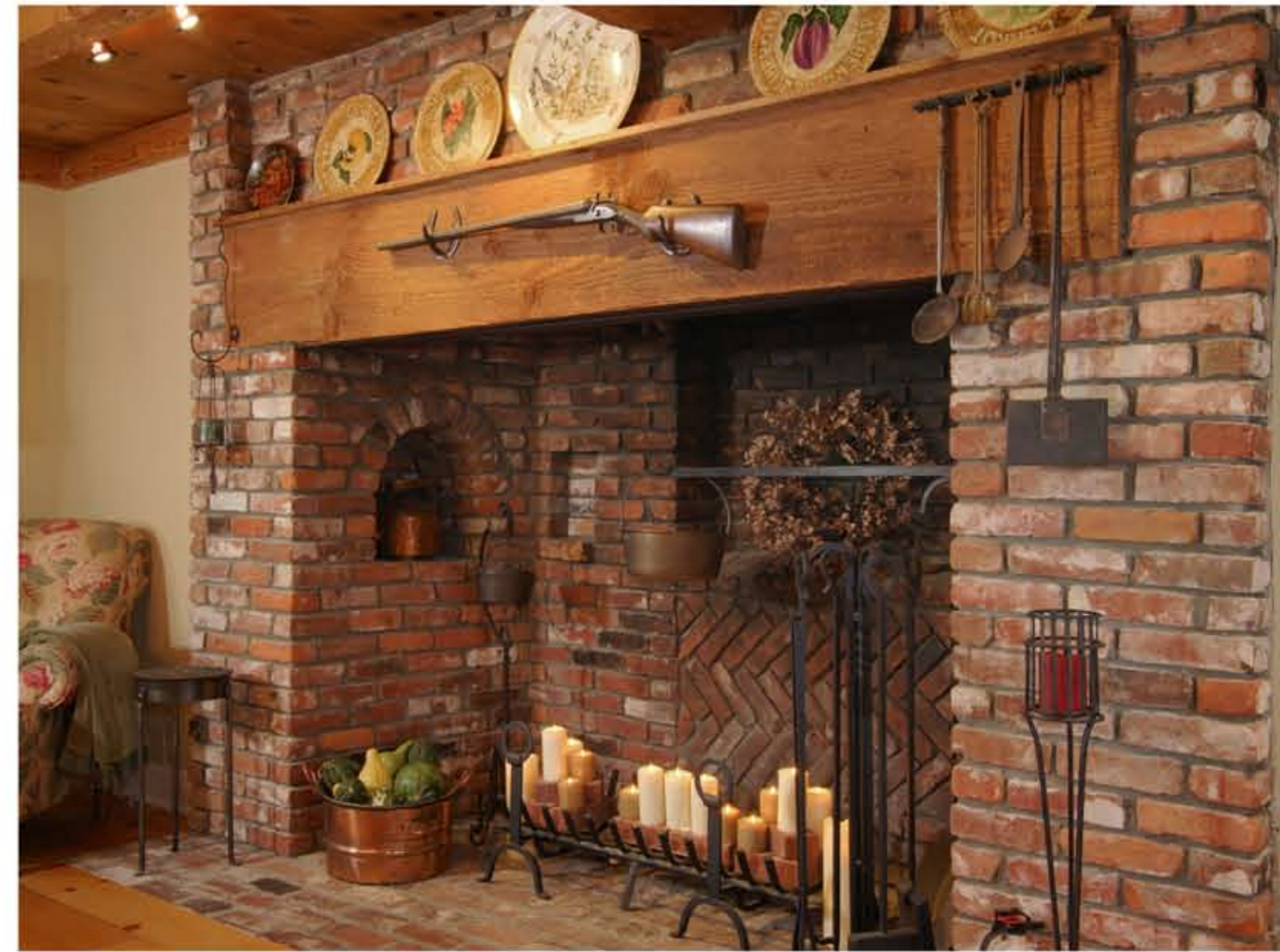
14-room, 3-storey main house with 5 bedrooms, 5 bathrooms, 7 fireplaces, built as an authentic replica of a 1760's Colonial Saltbox...wide plank pine floors, hand-hewn beams, hand-blown glass & hardware and fixtures hammered by blacksmiths in New England.