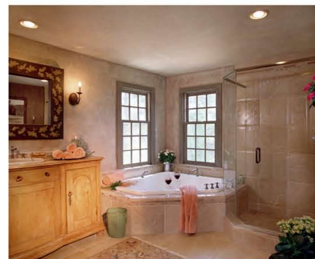
... in the main house, four of five bedrooms are exclusive suites each with fireplaces and private baths...