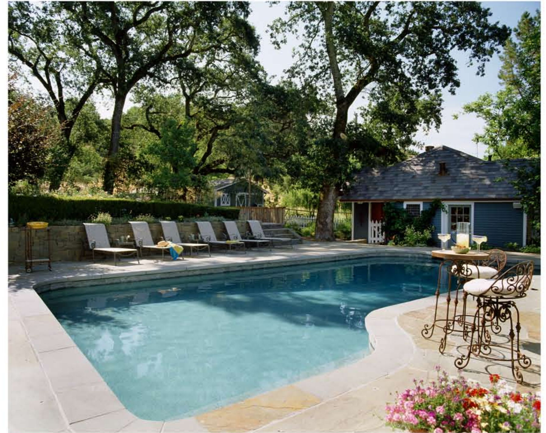
...pebble-bottomed, heated pool, whirlpool spa, pool cabana & exercise gym, and an outdoor stone-surround Viking stainless-steel grill & kitchen...