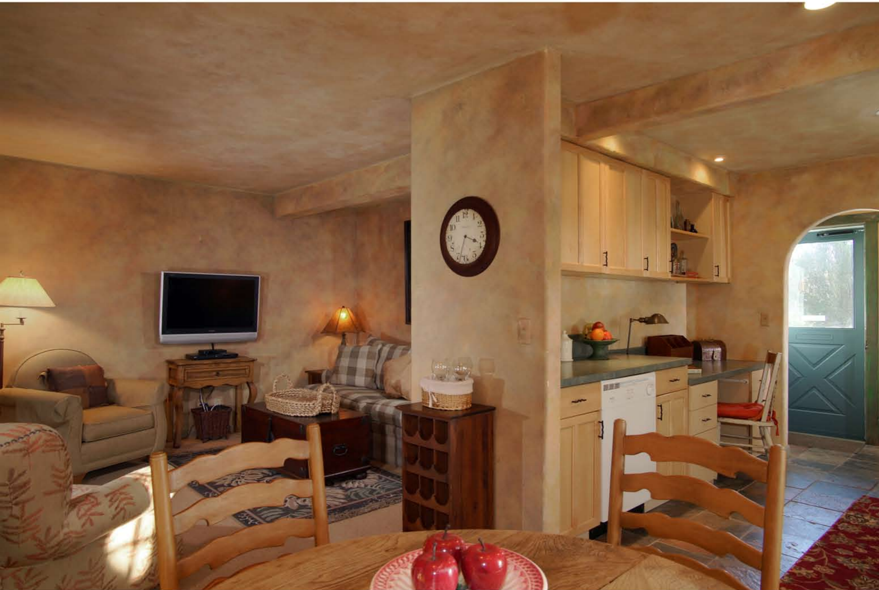
This two-story guest house is one of two on the estate, each with a full kitchen, bath, fireplace, living room, dining area, bedroom, ample closets and storage.