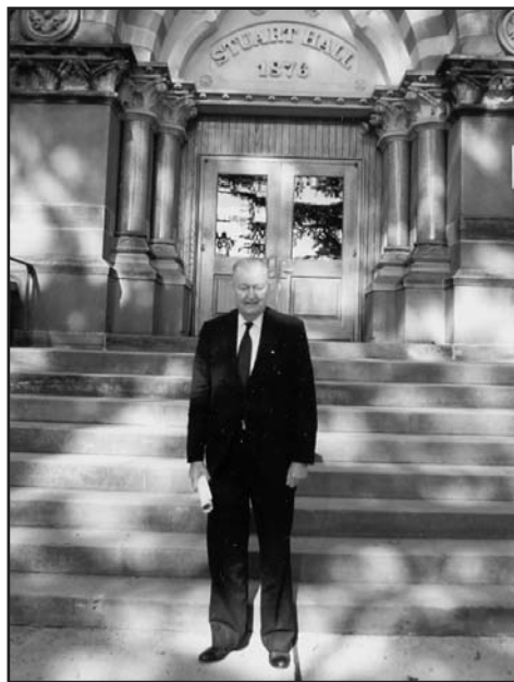
Carl McIntire stands in front of Stuart Hall during a visit to the Seminary campus in 1990.