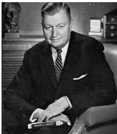
Carl McIntire holding his book, Author of Liberty , written in 1946.

Carl McIntire became a dogged media watcher, always willing to give input and advice to both print and broadcast journalists about religious topics. This activism would eventually lead McIntire into a pioneering career as a religious broadcaster and journalist. McIntire's Bible Presbyterian Church grew in both numbers and stature during the late 1930s, and in 1936, McIntire founded the Christian Beacon , a newspaper he used as his main platform for expressing his religious and political viewpoints. The Beacon was published weekly by the Christian Beacon Press, a Collingswood-based company founded by McIntire that also printed and distributed religious books and pamphlets, and copies of McIntire's sermons and radio topic packets. In 1955, McIntire founded the 20th Century Reformation Hour radio show. At the height of its popularity, it was carried on hundreds of radio stations nationwide. Contributions from loyal listeners amounted to millions of dollars per year, which enabled McIntire to acquire considerable