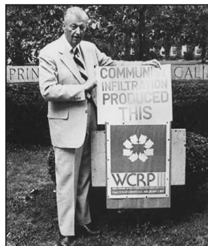
McIntire demonstrating against the World Conference of Religions for Peace at Princeton Seminary, 1979.

Funding for the continuing work on the McIntire Papers project has been provided through a generous grant from the Arthur Vining Davis Foundations of Jacksonville, Florida. ■