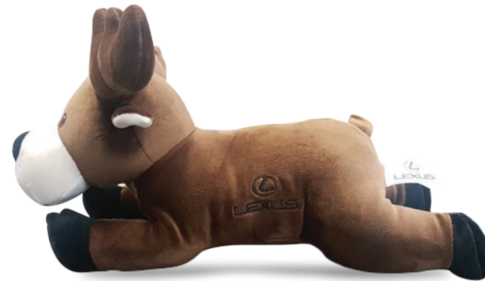
A. LEXUS STUFFED MOOSE Custom Lexus super soft bear stuffy, celebrating animals in Canada LEX0208BLKNSZ MSRP: $ 9.64