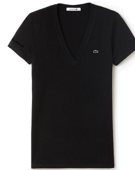
C. LEXUS LADIES' DIVA V NECK TEE Heathered t-shirt for women with V-neck and gradient appearance. Made of 60% cotton, 40% polyester; 3.5 oz. LEX0045BLK MSRP: $ 17.91