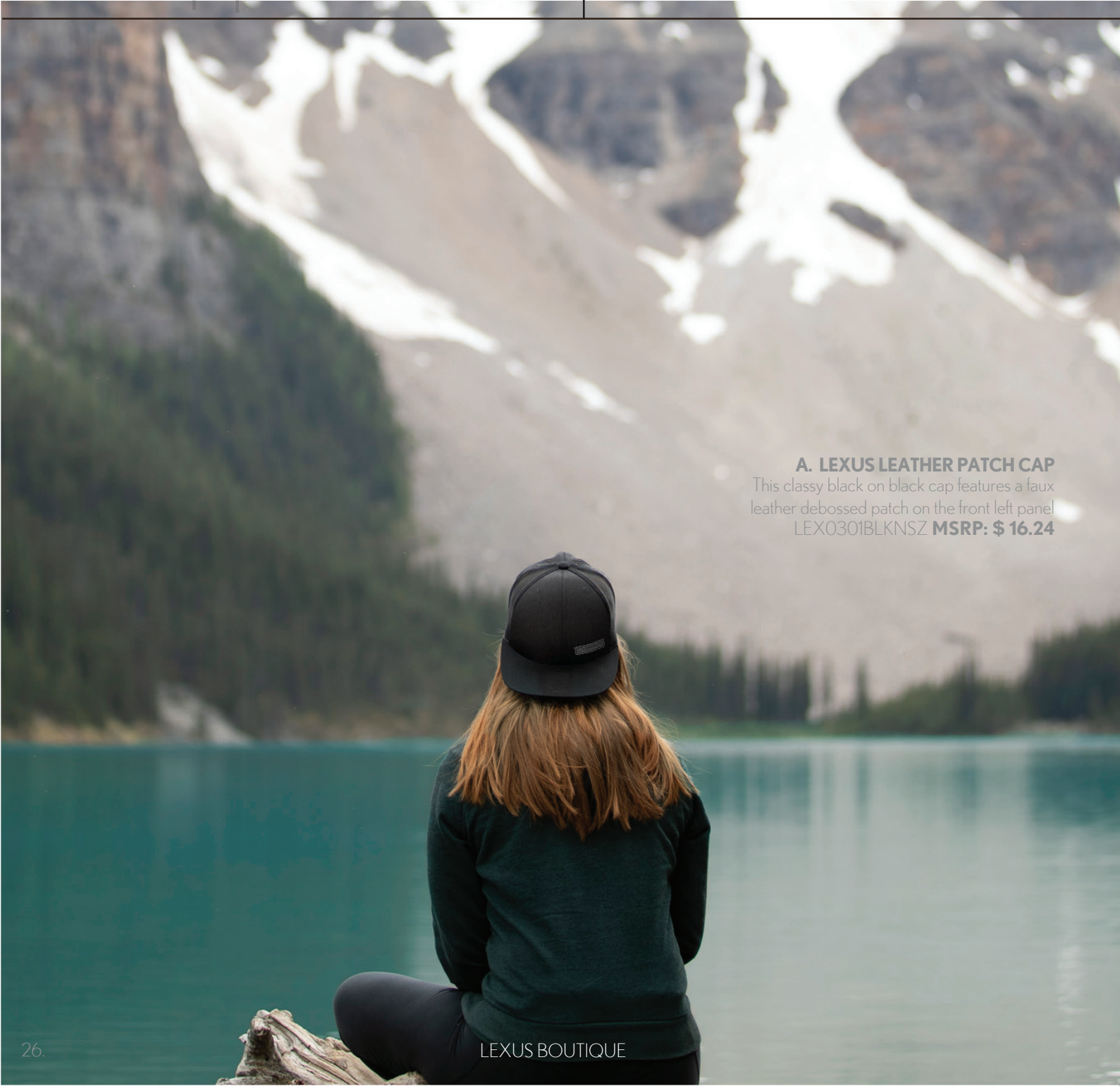
A. LEXUS LEATHER PATCH CAP This classy black on black cap features a faux leather debossed patch on the front left panel. LEX0301BLKNSZ MSRP: $ 16.24