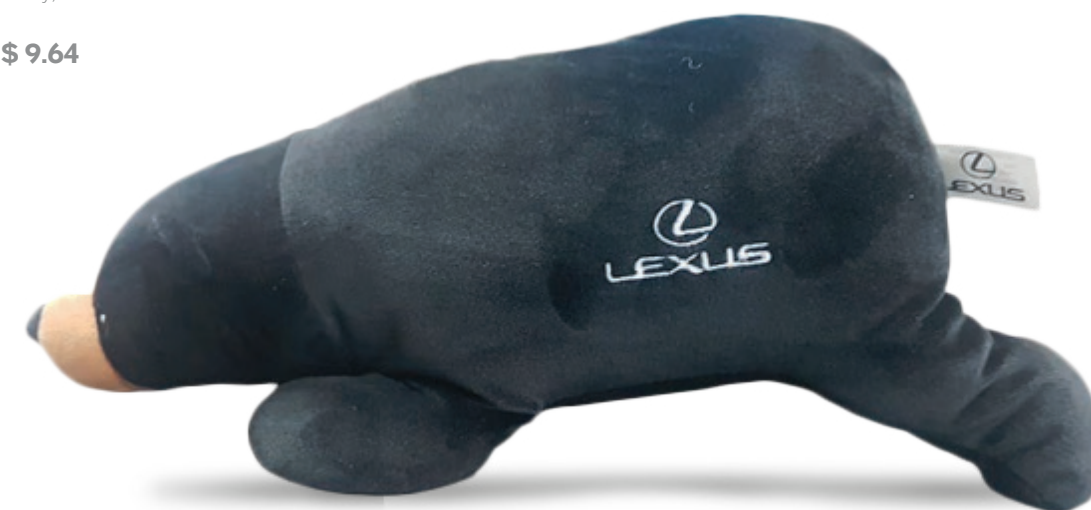
B. LEXUS STUFFED BEAR Custom Lexus super soft bear stuffy, celebrating animals in Canada LEX0207LBNNSZ MSRP: $ 9.64