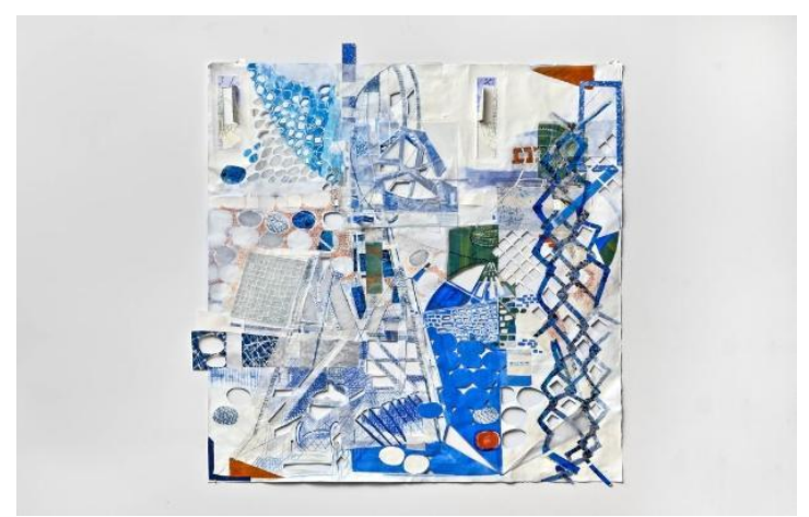
Balancing Act 1, 2013 - Colored pencil, paint, ink and collage - 44" x 42"

FRAN SIEGEL at Lesley Heller Workspace through December 01,2013