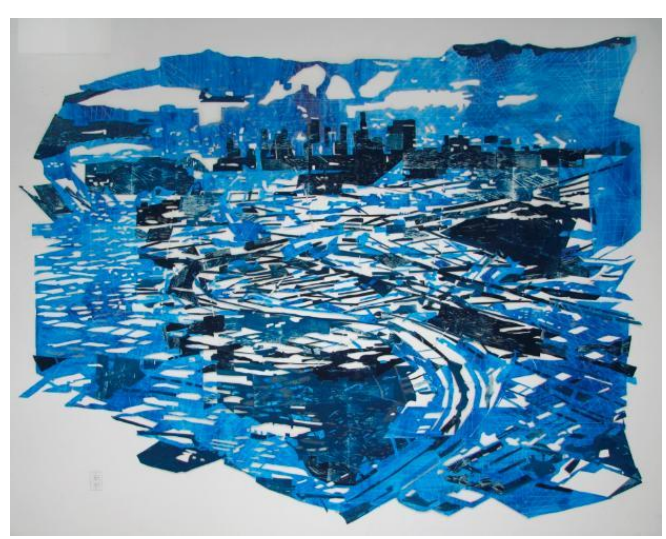
Overland 16, 2013, Cyanotype, Ink, Pencil and Pigment on Cut Paper 96 x 140

I've never had an interest in making something look real, and I still don't. I am much more interested in documenting and creating a dynamic viewing experience.